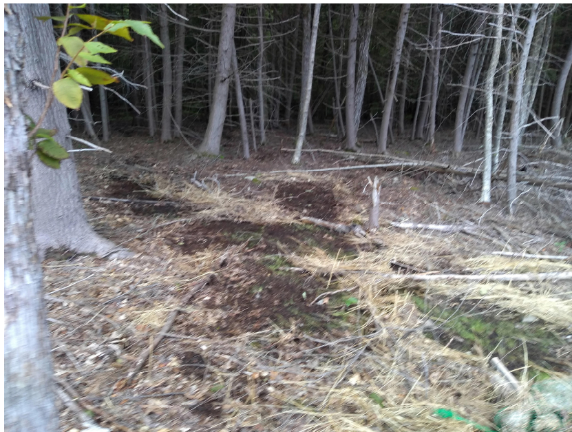
View of area downgradient of Discharge 2—facing west.

PHOTOGRAPHIC DOCUMENTATION North Sturbridge Road Solar Facility Charlton, Massachusetts Photographs Documented 09.02.2021