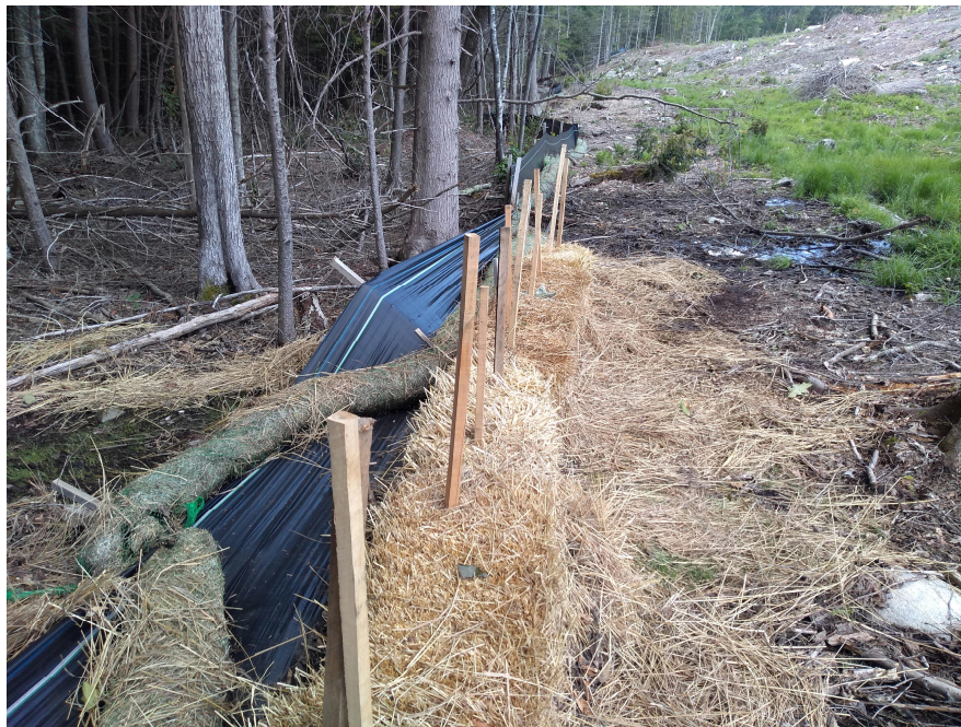
View of the damage erosion control measures associated with Discharge 2—facing north.