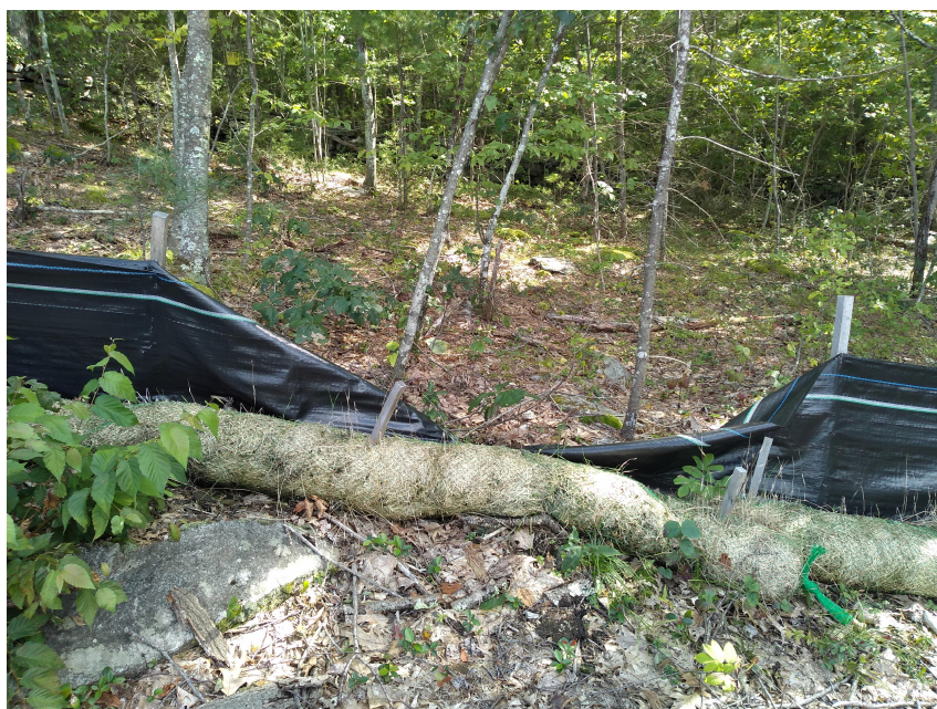
View of the damaged silt fence in southern perimeter of Site —facing south.