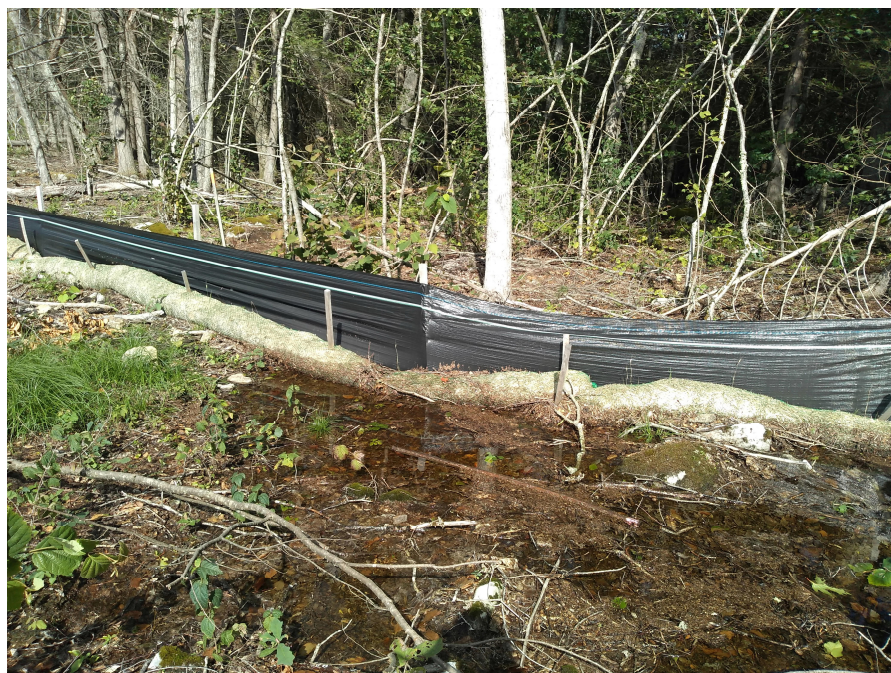
View of degraded straw wattle at southeast perimeter of Site —facing east.

PHOTOGRAPHIC DOCUMENTATION North Sturbridge Road Solar Facility Charlton, Massachusetts Photographs Documented 09.02.2021