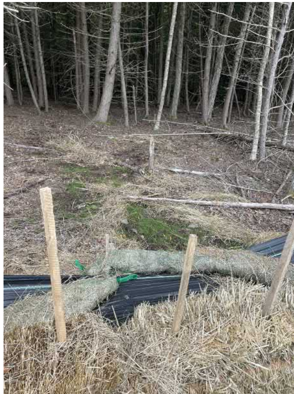
View of area downgradient of Discharge 2—facing west.

PHOTOGRAPHIC DOCUMENTATION North Sturbridge Road Solar Facility Charlton, Massachusetts Photographs Documented 09.17.2021