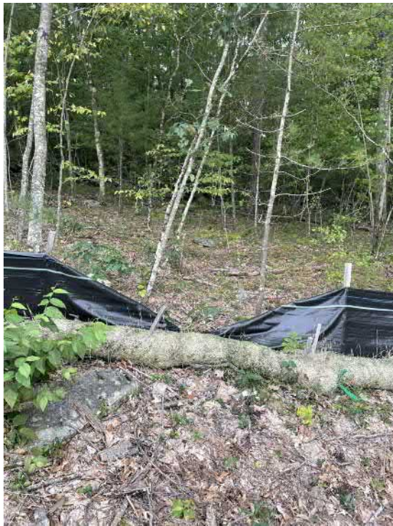
View of the damaged silt fence in southern perimeter of Site —facing south.