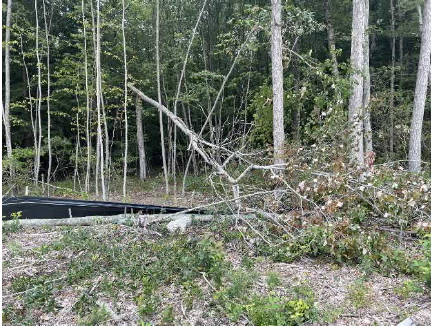
View of tree fallen on northwestern portion of Zone 5.