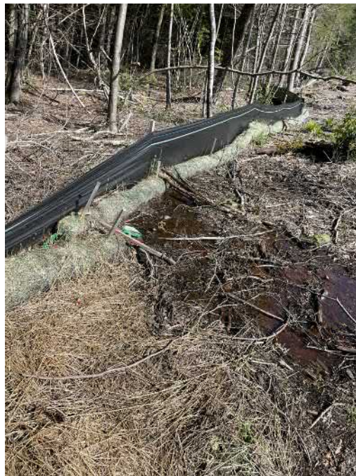
View of degraded straw wattle at southeast perimeter of Site —facing east.

PHOTOGRAPHIC DOCUMENTATION North Sturbridge Road Solar Facility Charlton, Massachusetts Photographs Documented 09.17.2021