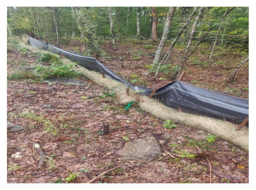
View of the damaged silt fence in southern perimeter of Site —facing south.