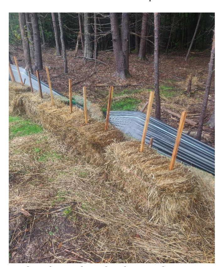
View of area downgradient of Discharge 2—facing west.