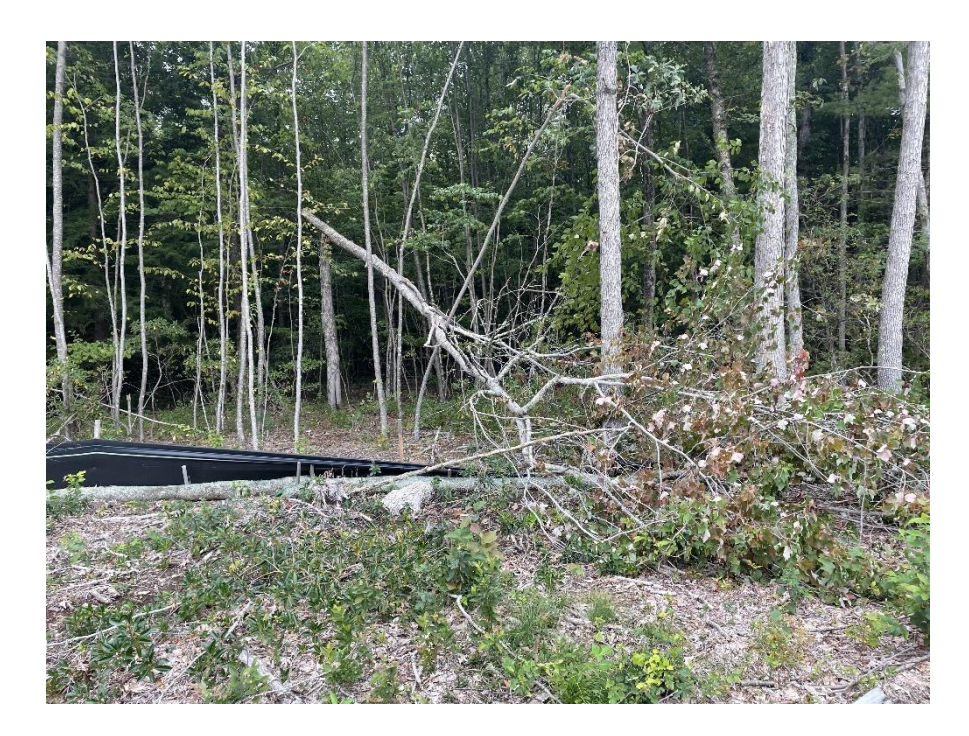
View of tree fallen on northwestern portion of Zone 5.