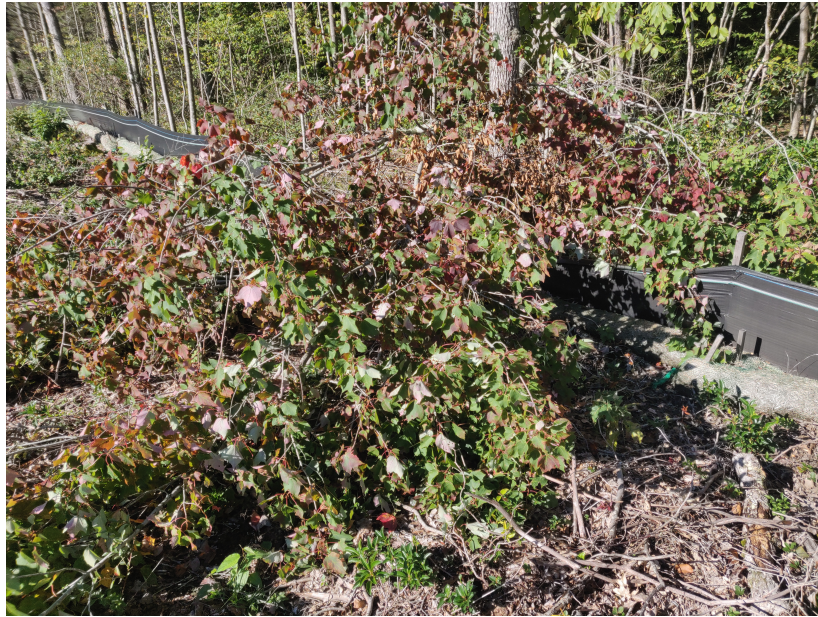
View of tree fallen on northwestern portion of Zone 5.