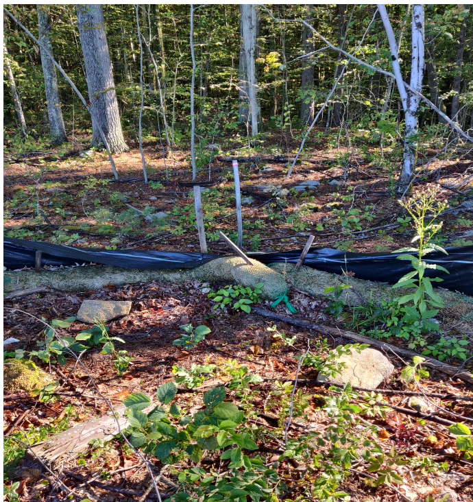
View of damaged silt fence in south east portion of the Site —facing south east

PHOTOGRAPHIC DOCUMENTATION North Sturbridge Road Solar Facility Charlton, Massachusetts Photographs Documented 09.29.2021