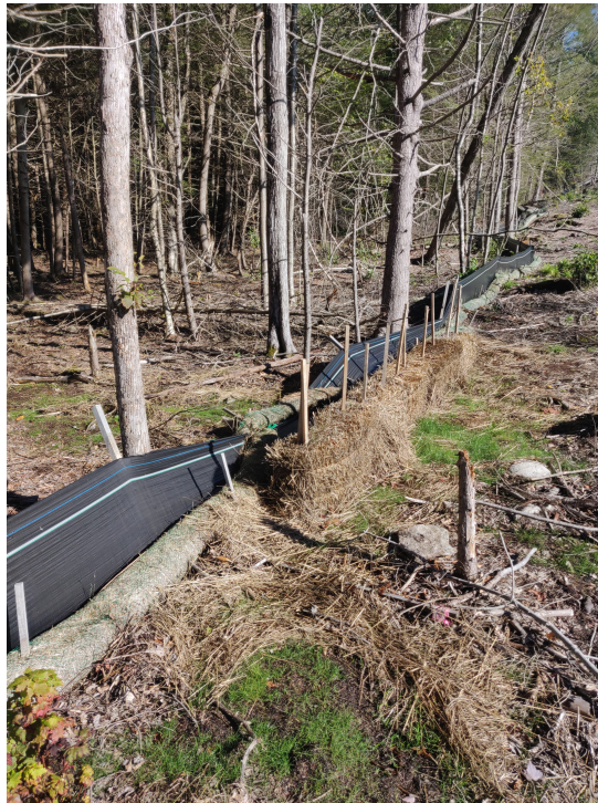
View of area downgradient of Discharge 2—facing north west.

PHOTOGRAPHIC DOCUMENTATION North Sturbridge Road Solar Facility Charlton, Massachusetts Photographs Documented 09.29.2021