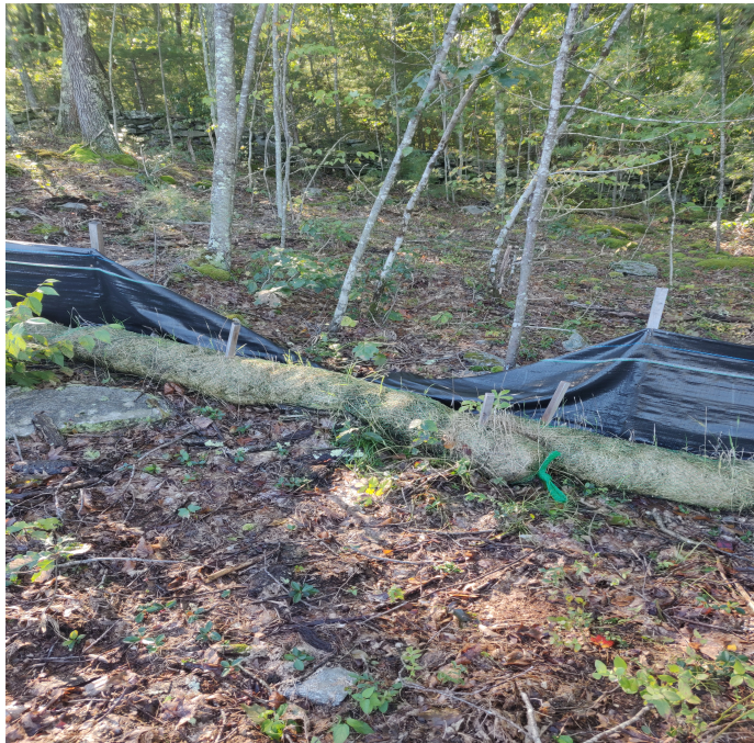
View of the damaged silt fence in southern perimeter of Site —facing south.