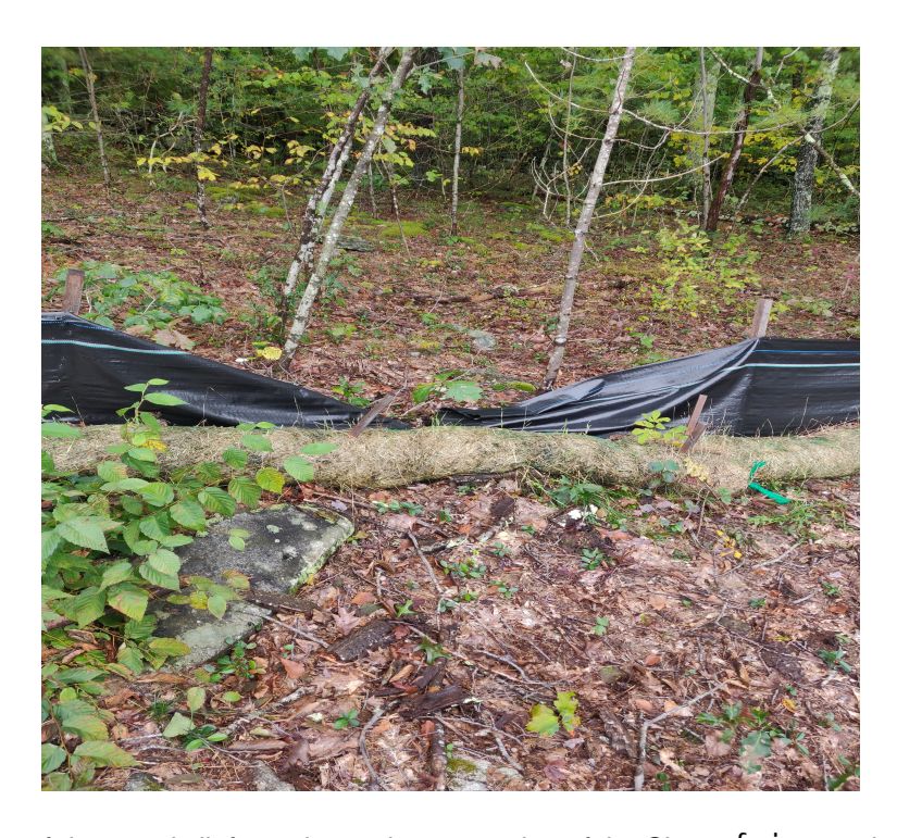
View of damaged silt fence in south east portion of the Site —facing south east

PHOTOGRAPHIC DOCUMENTATION North Sturbridge Road Solar Facility Charlton, Massachusetts Photographs Documented 10.05.2021