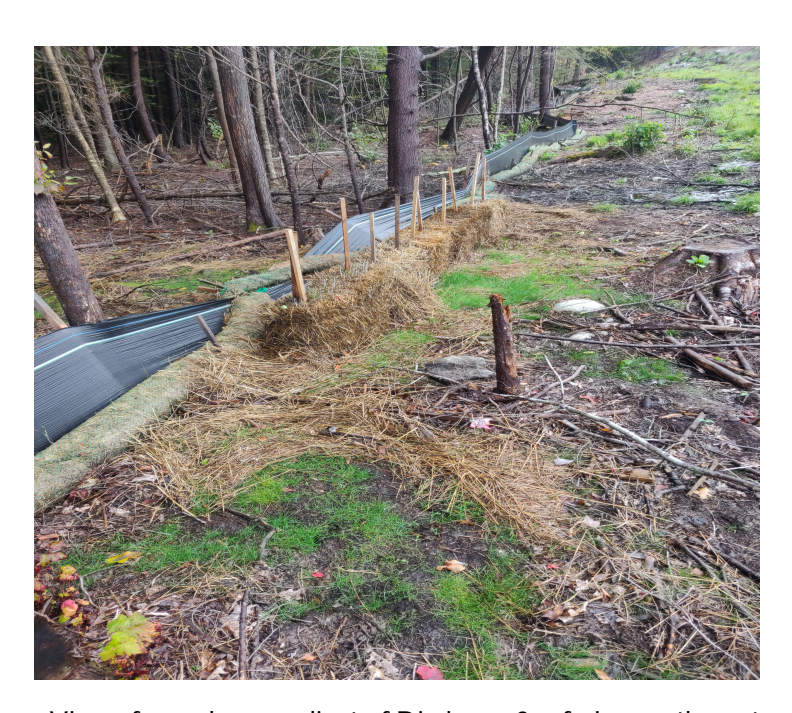
View of area downgradient of Discharge 2—facing north west.

PHOTOGRAPHIC DOCUMENTATION North Sturbridge Road Solar Facility Charlton, Massachusetts Photographs Documented 10.05.2021