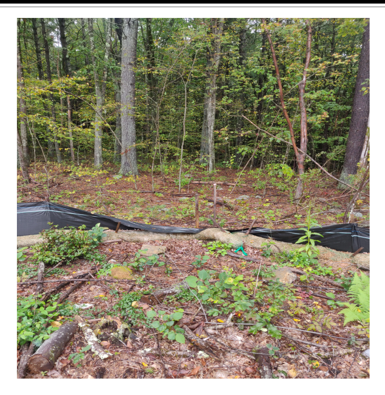
View of the damaged silt fence in southern perimeter of Site —facing south.