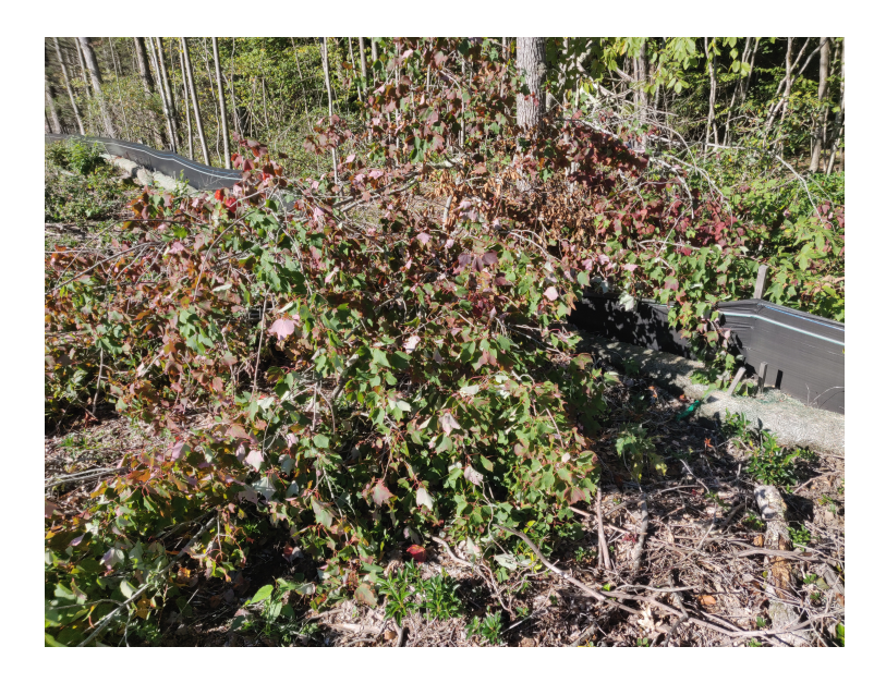
View of tree fallen on northwestern portion of Zone 5.