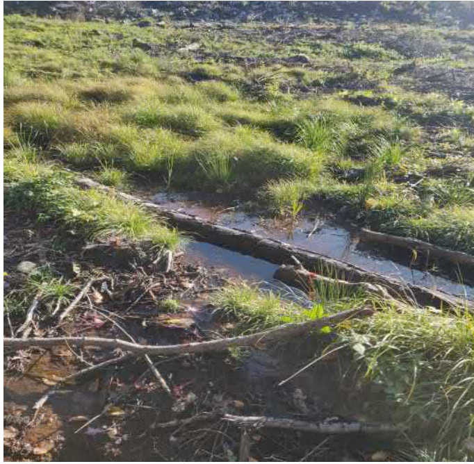
View of the water pooling in western perimeter of Site —facing east.

PHOTOGRAPHIC DOCUMENTATION North Sturbridge Road Solar Facility Charlton, Massachusetts Photographs Documented 10.18.2021