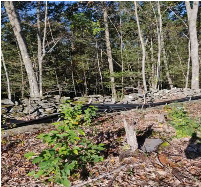
View of damaged silt fence in south west portion of the Site —facing south west

PHOTOGRAPHIC DOCUMENTATION North Sturbridge Road Solar Facility Charlton, Massachusetts Photographs Documented 10.18.2021