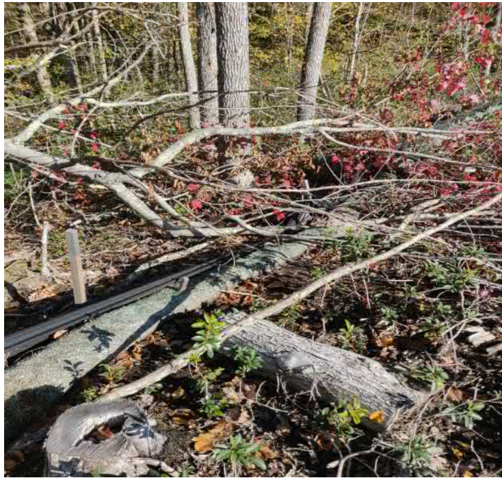
View of tree fallen on northwestern portion of Zone 5.