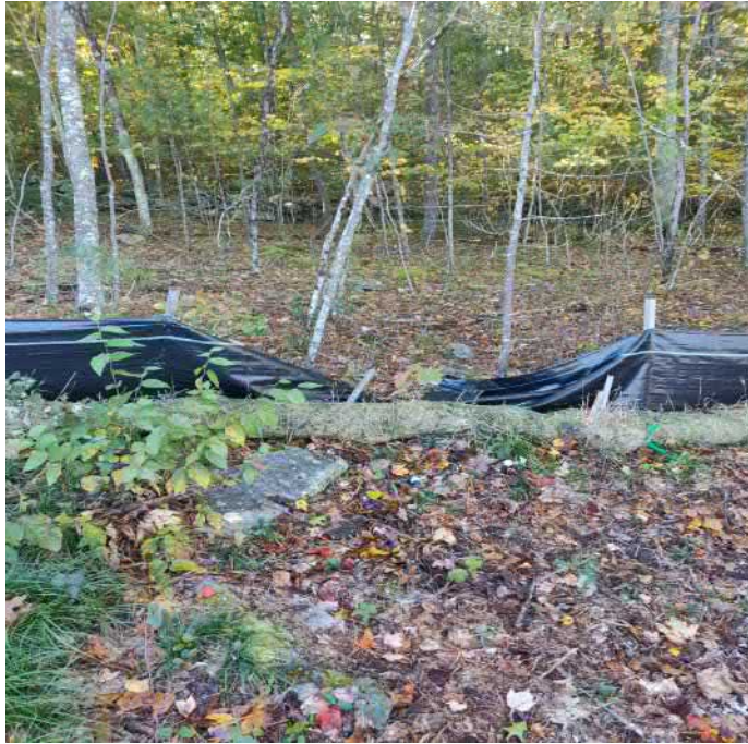
View of the damaged silt fence in southern perimeter of Site —facing south.