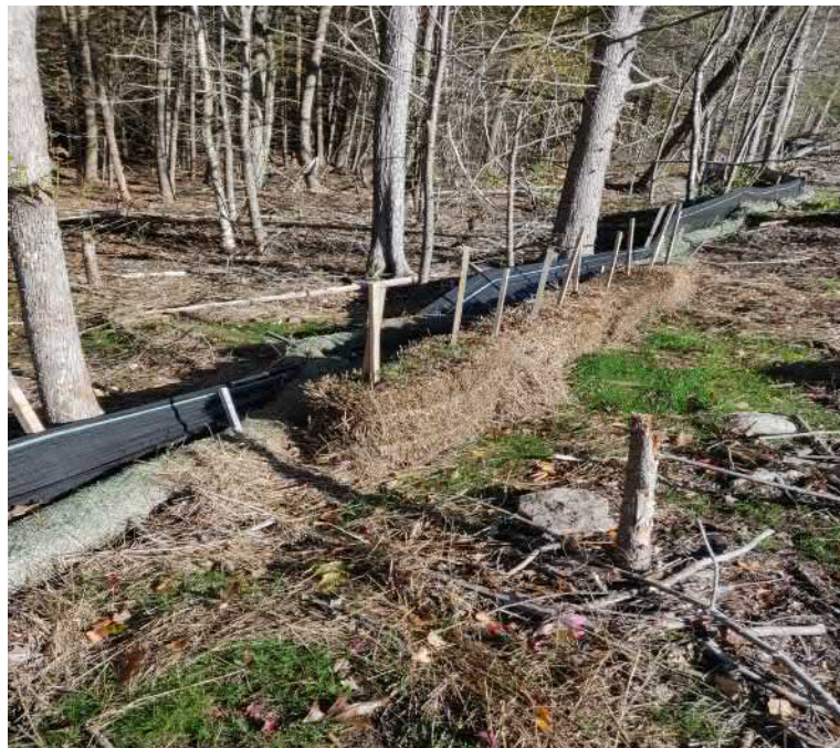
View of area downgradient of Discharge 2—facing north west.

PHOTOGRAPHIC DOCUMENTATION North Sturbridge Road Solar Facility Charlton, Massachusetts Photographs Documented 10.18.2021