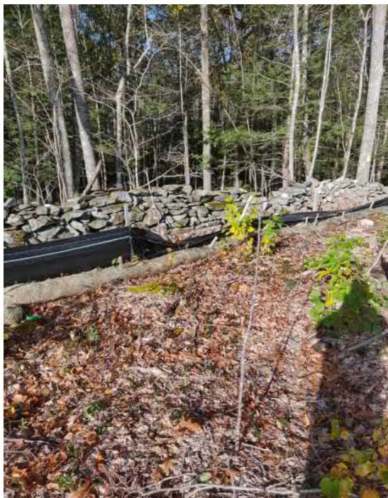
View of damaged silt fence in south west portion of the Site —facing south west

PHOTOGRAPHIC DOCUMENTATION North Sturbridge Road Solar Facility Charlton, Massachusetts Photographs Documented 10.29.2021