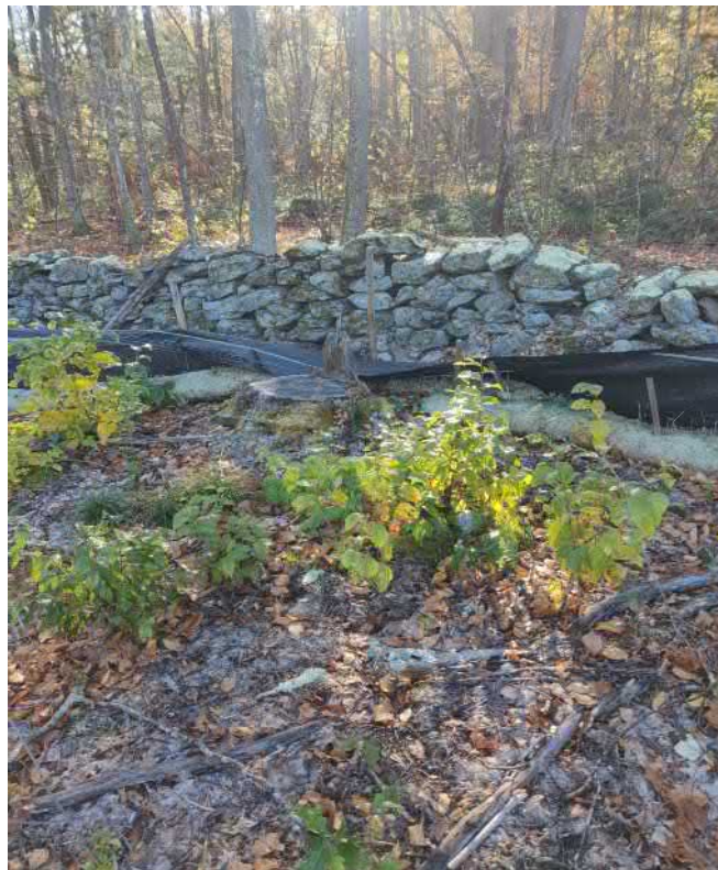
View of damaged silt fence in eastern portion of the Site —facing east

PHOTOGRAPHIC DOCUMENTATION North Sturbridge Road Solar Facility Charlton, Massachusetts Photographs Documented 10.29.2021