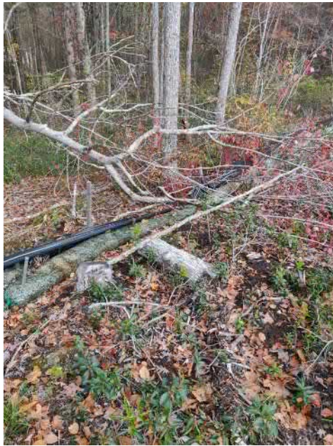
View of tree fallen on northwestern portion of Zone 5.