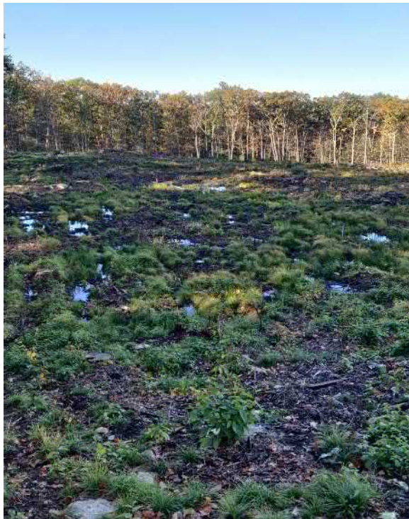
View of the water pooling in eastern perimeter of Site —facing south east.