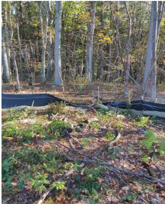
View of damaged silt fence in south east portion of the Site —facing south east

PHOTOGRAPHIC DOCUMENTATION North Sturbridge Road Solar Facility Charlton, Massachusetts Photographs Documented 10.29.2021