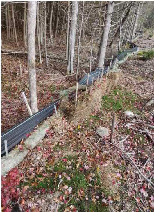
View of area downgradient of Discharge 2—facing north west.

PHOTOGRAPHIC DOCUMENTATION North Sturbridge Road Solar Facility Charlton, Massachusetts Photographs Documented 10.29.2021