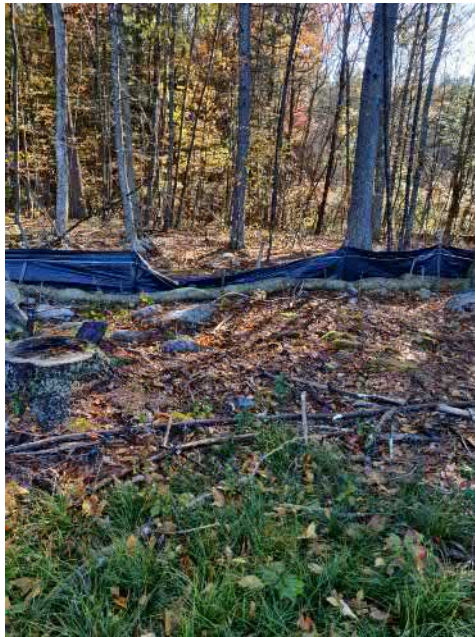
View of damaged silt fence in eastern portion of the Site —facing east