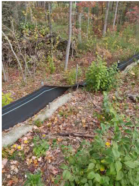
View of damaged silt fence in north western portion of the Site —facing north west

PHOTOGRAPHIC DOCUMENTATION North Sturbridge Road Solar Facility Charlton, Massachusetts Photographs Documented 10.29.2021