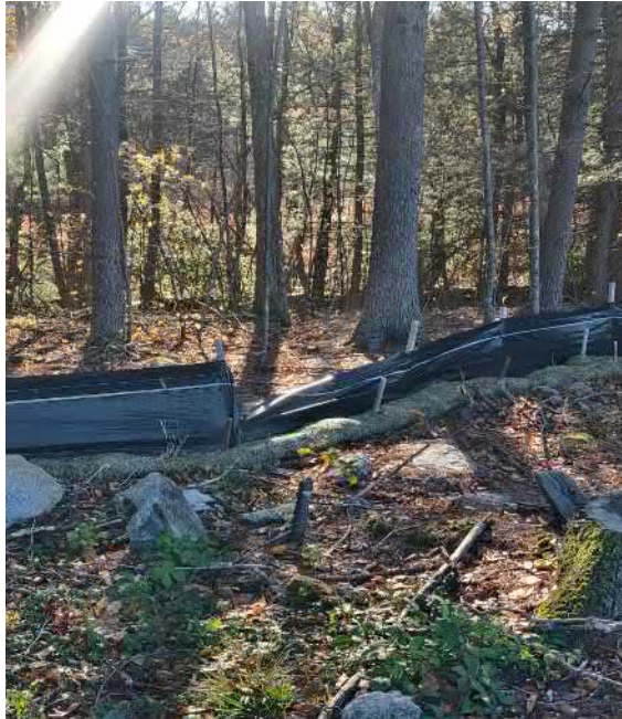
View of damaged silt fence in eastern portion of the Site —facing east