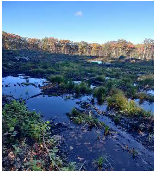
View of the water pooling in eastern perimeter of Site —facing south east.