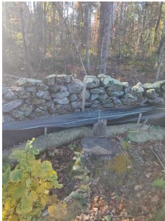
View of damaged silt fence in eastern portion of the Site —facing east

PHOTOGRAPHIC DOCUMENTATION North Sturbridge Road Solar Facility Charlton, Massachusetts Photographs Documented 11.01.2021