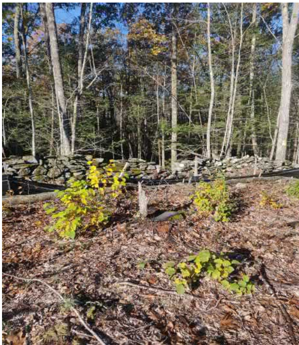
View of damaged silt fence in south west portion of the Site —facing south west

PHOTOGRAPHIC DOCUMENTATION North Sturbridge Road Solar Facility Charlton, Massachusetts Photographs Documented 11.01.2021