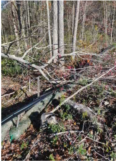
View of tree fallen on northwestern portion of Zone 5.