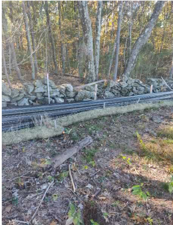
View of damaged silt fence in eastern portion of the Site —facing east