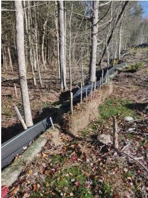
View of area downgradient of Discharge 2—facing north west.

PHOTOGRAPHIC DOCUMENTATION North Sturbridge Road Solar Facility Charlton, Massachusetts Photographs Documented 11.01.2021