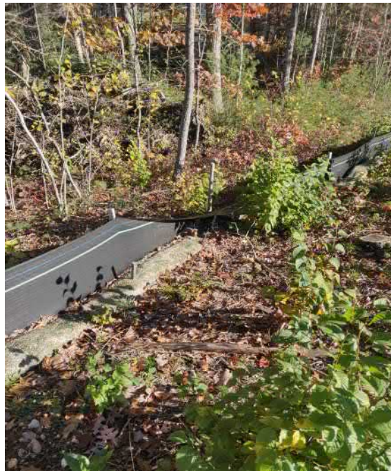
View of damaged silt fence in north western portion of the Site —facing north west

PHOTOGRAPHIC DOCUMENTATION North Sturbridge Road Solar Facility Charlton, Massachusetts Photographs Documented 11.01.2021