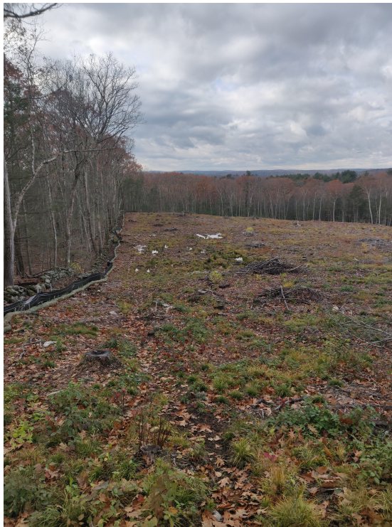
View of the water pooling in eastern perimeter of Site —facing south east.