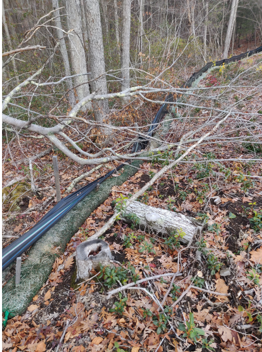
View of tree fallen on northwestern portion of Zone 5.