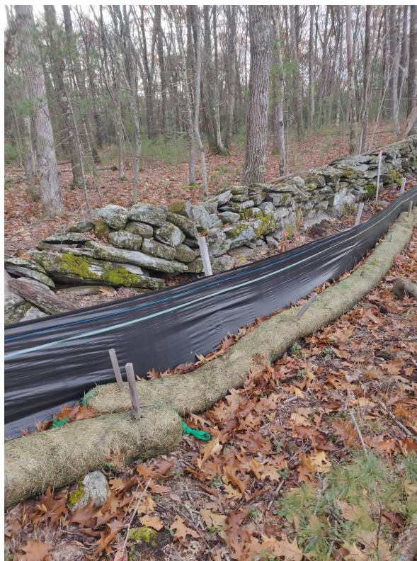
View of damaged silt fence in eastern portion of the Site —facing east

PHOTOGRAPHIC DOCUMENTATION North Sturbridge Road Solar Facility Charlton, Massachusetts Photographs Documented 11.15.2021