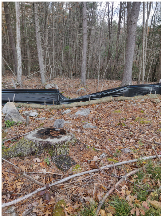
View of damaged silt fence in eastern portion of the Site —facing east