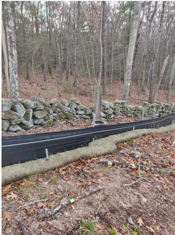
View of damaged silt fence in eastern portion of the Site —facing east