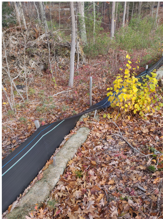
View of damaged silt fence in north western portion of the Site —facing north west

PHOTOGRAPHIC DOCUMENTATION North Sturbridge Road Solar Facility Charlton, Massachusetts Photographs Documented 11.15.2021