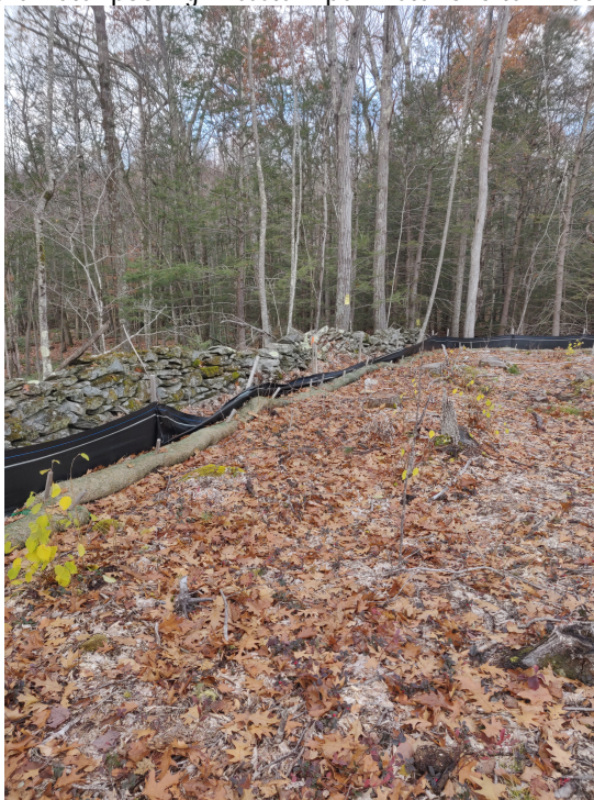
View of damaged silt fence in south west portion of the Site —facing south west

PHOTOGRAPHIC DOCUMENTATION North Sturbridge Road Solar Facility Charlton, Massachusetts Photographs Documented 11.15.2021