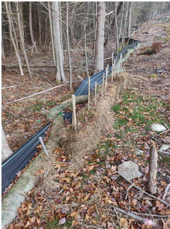
View of area downgradient of Discharge 2—facing north west.

PHOTOGRAPHIC DOCUMENTATION North Sturbridge Road Solar Facility Charlton, Massachusetts Photographs Documented 11.15.2021