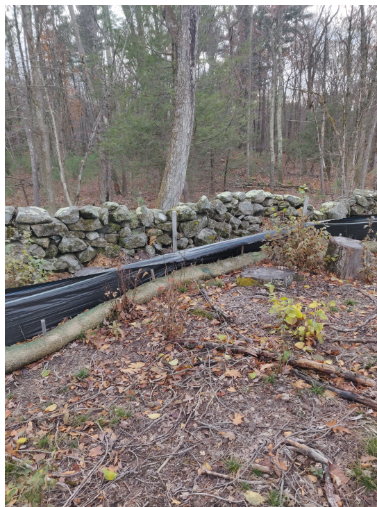
View of damaged silt fence in south west portion of the Site —facing south west

PHOTOGRAPHIC DOCUMENTATION North Sturbridge Road Solar Facility Charlton, Massachusetts Photographs Documented 11.15.2021