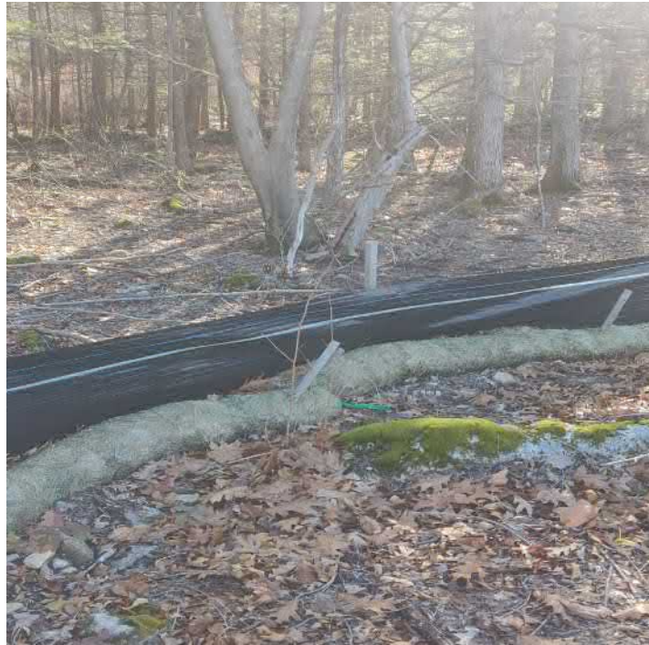
View of damaged silt fence in eastern portion of the Site —facing east