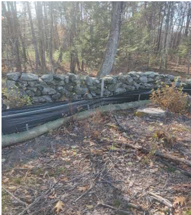
View of damaged silt fence in south west portion of the Site —facing south west

PHOTOGRAPHIC DOCUMENTATION North Sturbridge Road Solar Facility Charlton, Massachusetts Photographs Documented 11.19.2021