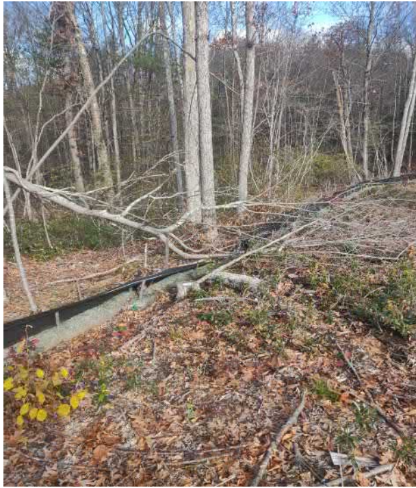
View of tree fallen on northwestern portion of Zone 5.