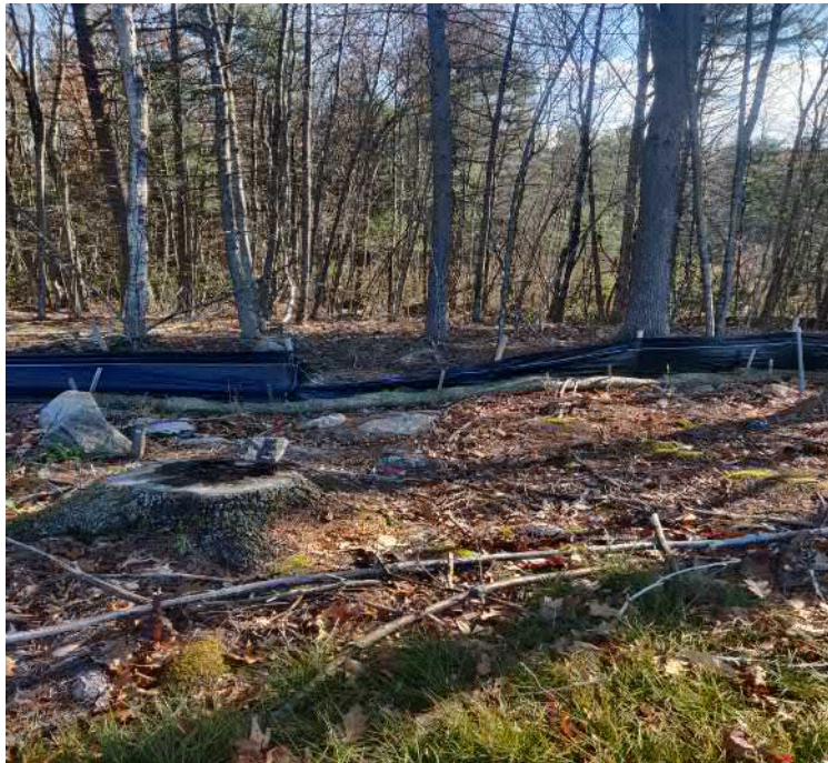
View of damaged silt fence in eastern portion of the Site —facing east