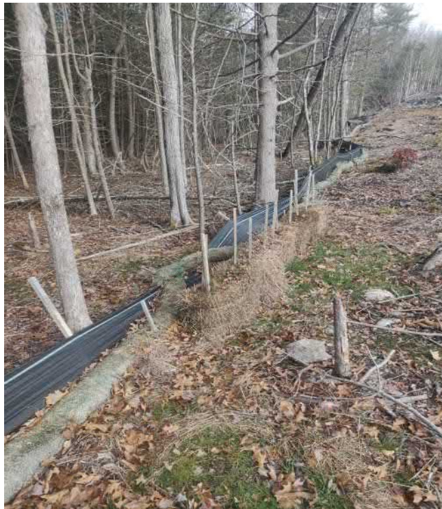
View of area downgradient of Discharge 2—facing north west.

PHOTOGRAPHIC DOCUMENTATION North Sturbridge Road Solar Facility Charlton, Massachusetts Photographs Documented 11.19.2021