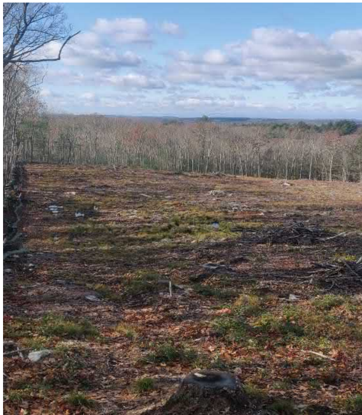
View of the water pooling in eastern perimeter of Site —facing south east.