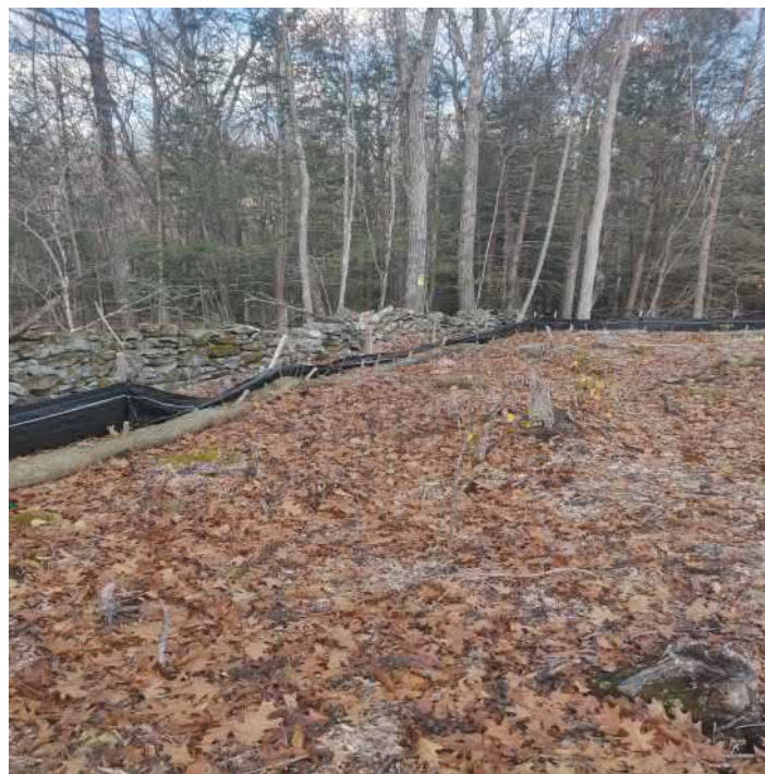
View of damaged silt fence in south west portion of the Site —facing south west

PHOTOGRAPHIC DOCUMENTATION North Sturbridge Road Solar Facility Charlton, Massachusetts Photographs Documented 11.19.2021