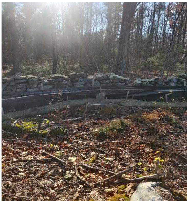
View of damaged silt fence in eastern portion of the Site —facing east

PHOTOGRAPHIC DOCUMENTATION North Sturbridge Road Solar Facility Charlton, Massachusetts Photographs Documented 11.19.2021