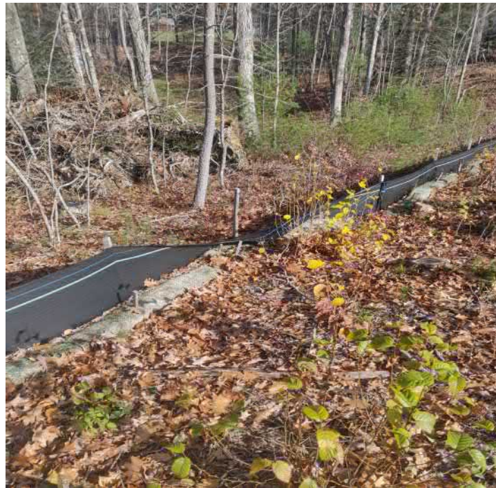
View of damaged silt fence in north western portion of the Site —facing north west

PHOTOGRAPHIC DOCUMENTATION North Sturbridge Road Solar Facility Charlton, Massachusetts Photographs Documented 11.19.2021