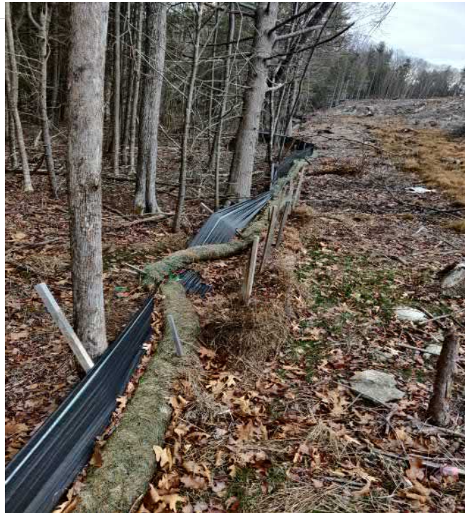
View of area downgradient of Discharge 2—facing north west.

PHOTOGRAPHIC DOCUMENTATION North Sturbridge Road Solar Facility Charlton, Massachusetts Photographs Documented 12.27.2021