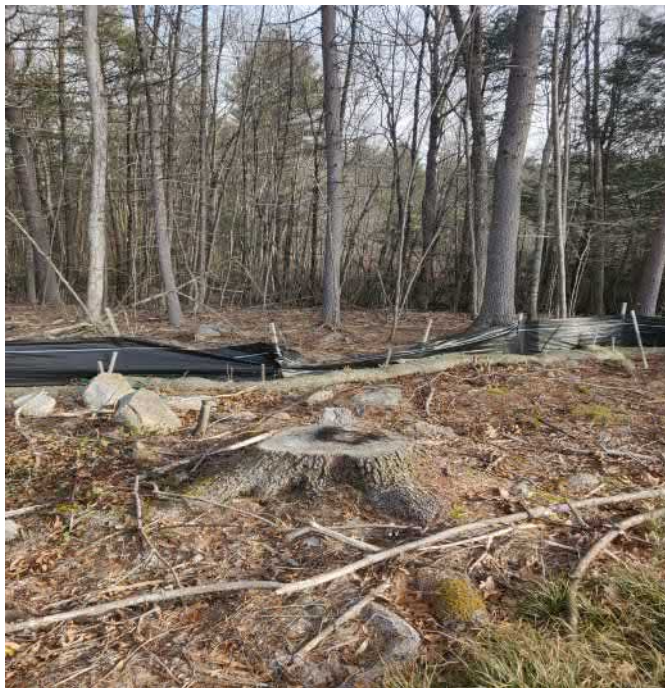
View of damaged silt fence in eastern portion of the Site —facing east