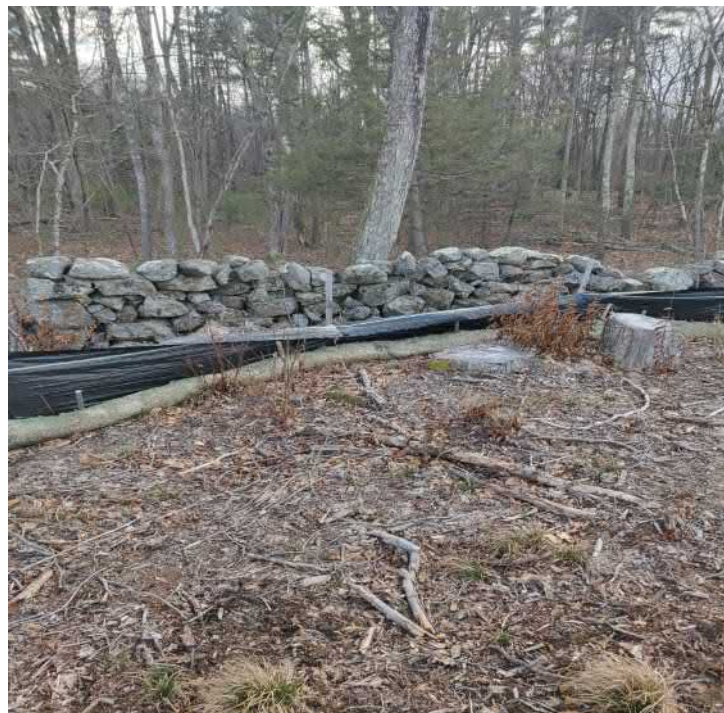
View of damaged silt fence in south west portion of the Site —facing south west

PHOTOGRAPHIC DOCUMENTATION North Sturbridge Road Solar Facility Charlton, Massachusetts Photographs Documented 12.27.2021