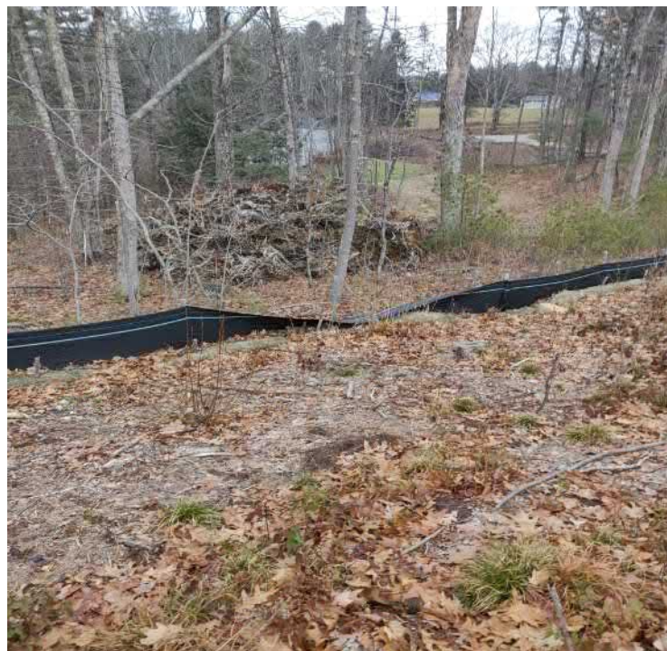
View of damaged silt fence in north western portion of the Site —facing north west

PHOTOGRAPHIC DOCUMENTATION North Sturbridge Road Solar Facility Charlton, Massachusetts Photographs Documented 12.27.2021