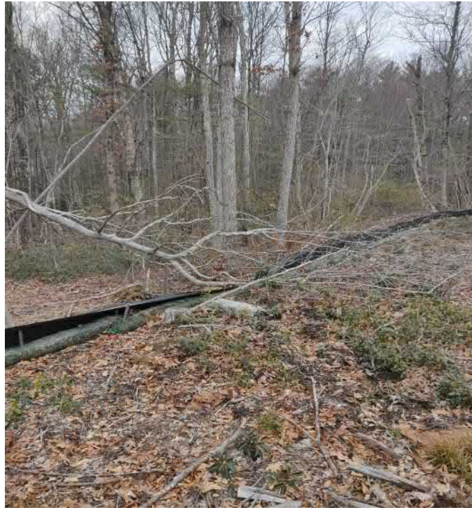
View of tree fallen on northwestern portion of Zone 5.