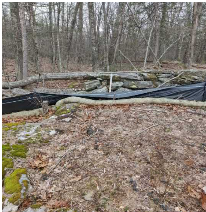
View of damaged silt fence and waddle in south eastern portion of the Site —facing south east

PHOTOGRAPHIC DOCUMENTATION North Sturbridge Road Solar Facility Charlton, Massachusetts Photographs Documented 12.27.2021