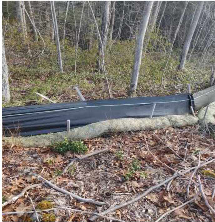
View of damaged silt fence and waddle in eastern portion of the Site —facing north east