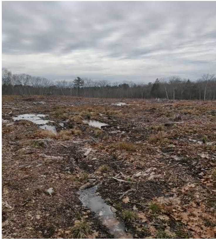
View of the water pooling in eastern perimeter of Site —facing south east.