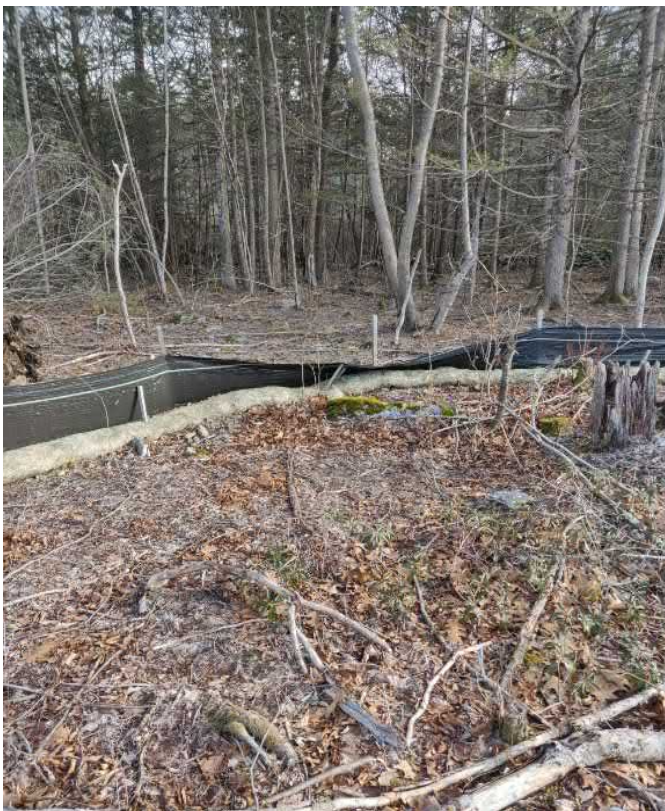
View of damaged silt fence in eastern portion of the Site —facing east

PHOTOGRAPHIC DOCUMENTATION North Sturbridge Road Solar Facility Charlton, Massachusetts Photographs Documented 12.27.2021