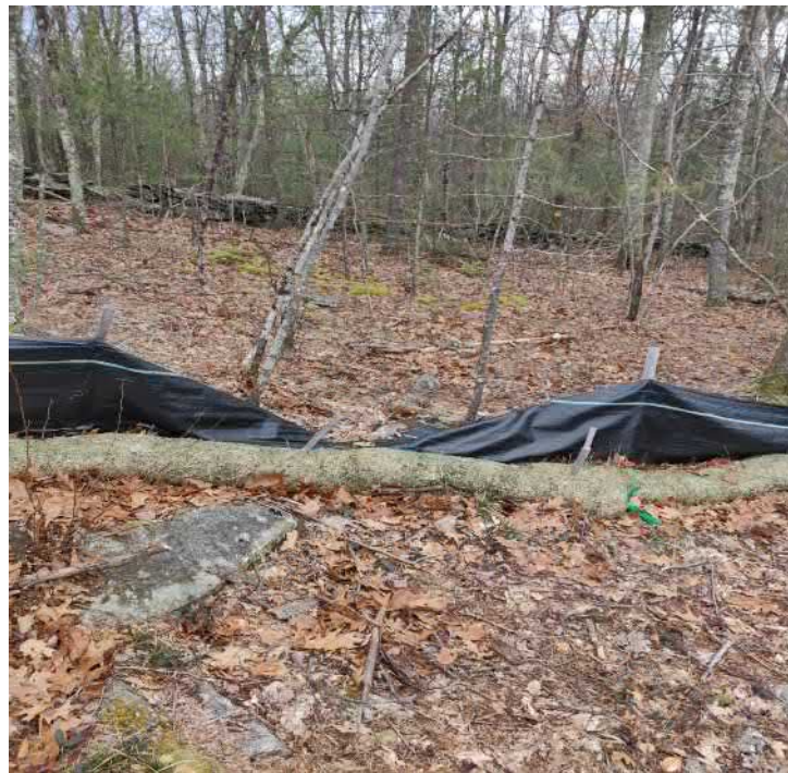
View of damaged silt fence in south east portion of the Site —facing south east

PHOTOGRAPHIC DOCUMENTATION North Sturbridge Road Solar Facility Charlton, Massachusetts Photographs Documented 12.27.2021