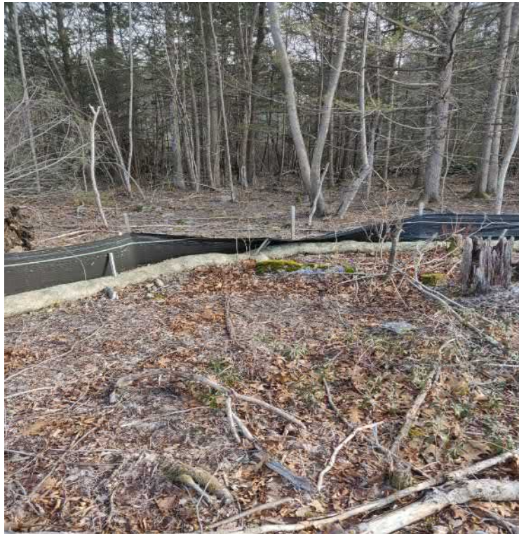
View of damaged silt fence in eastern portion of the Site —facing east