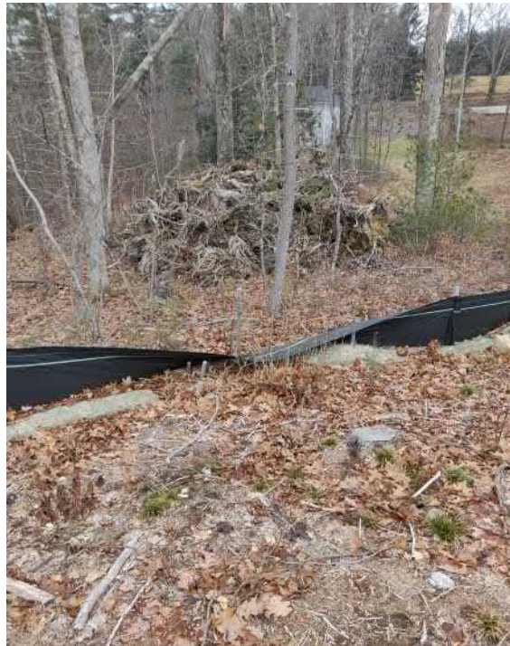
View of damaged silt fence in north western portion of the Site —facing north west

PHOTOGRAPHIC DOCUMENTATION North Sturbridge Road Solar Facility Charlton, Massachusetts Photographs Documented 01.03.2022