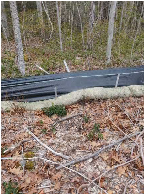
View of damaged silt fence and waddle in eastern portion of the Site —facing north east