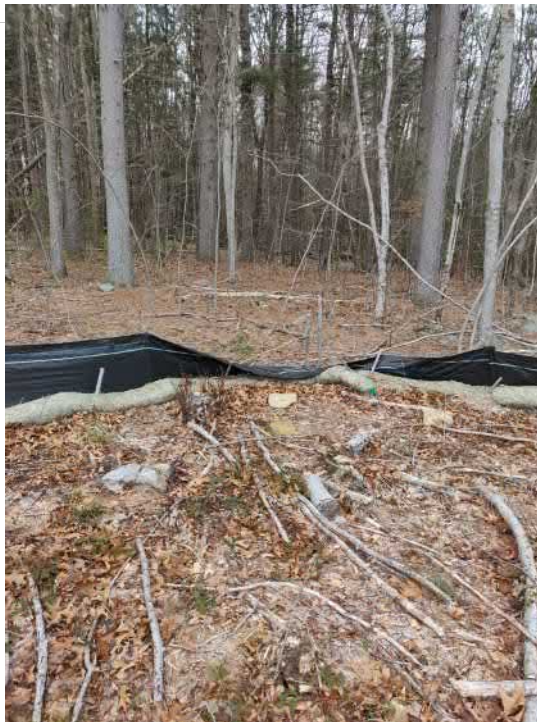
View of damaged silt fence and waddle in south eastern portion of the Site —facing south east

PHOTOGRAPHIC DOCUMENTATION North Sturbridge Road Solar Facility Charlton, Massachusetts Photographs Documented 01.03.2022