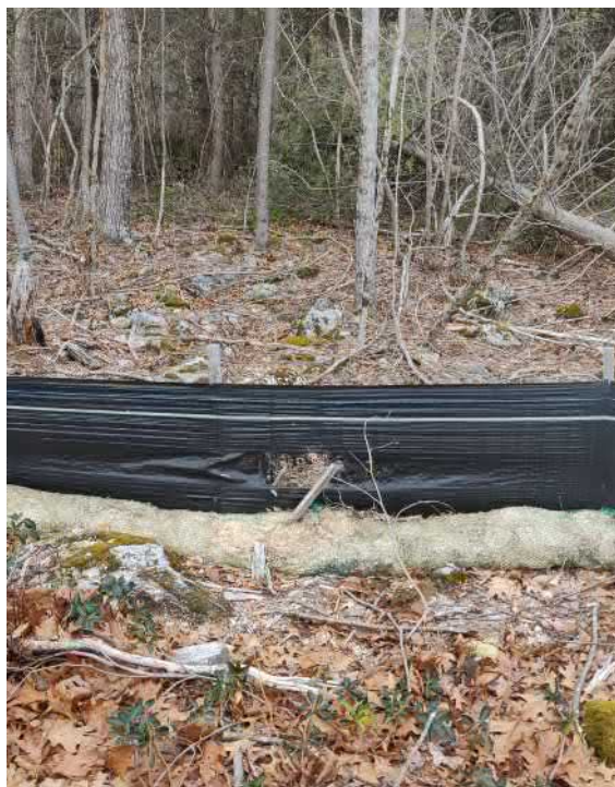
View of damaged silt fence and waddle in eastern portion of the Site —facing east

PHOTOGRAPHIC DOCUMENTATION North Sturbridge Road Solar Facility Charlton, Massachusetts Photographs Documented 01.03.2022