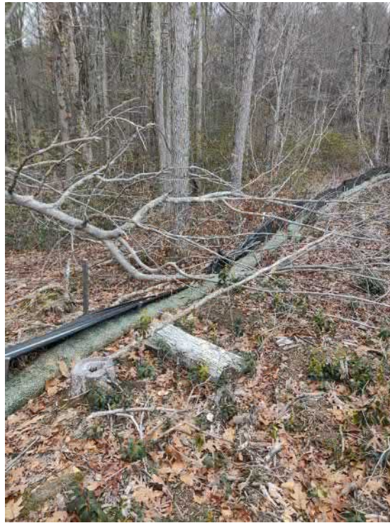
View of tree fallen on northwestern portion of Zone 5.