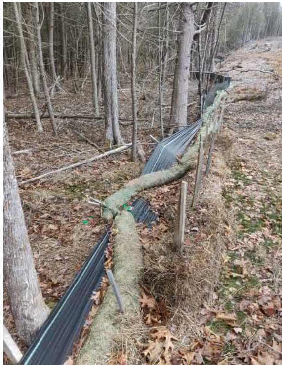
View of area downgradient of Discharge 2—facing north west.

PHOTOGRAPHIC DOCUMENTATION North Sturbridge Road Solar Facility Charlton, Massachusetts Photographs Documented 01.03.2022