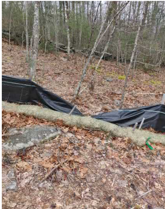
View of damaged silt fence in south east portion of the Site —facing south east

PHOTOGRAPHIC DOCUMENTATION North Sturbridge Road Solar Facility Charlton, Massachusetts Photographs Documented 01.03.2022