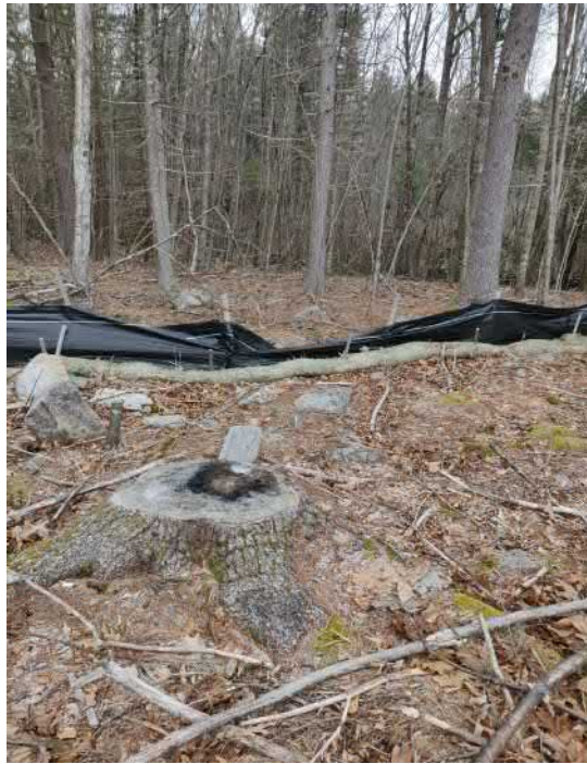
View of damaged silt fence in eastern portion of the Site —facing east