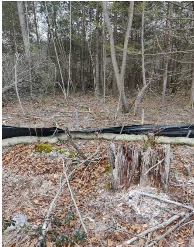
View of damaged silt fence in eastern portion of the Site —facing east

PHOTOGRAPHIC DOCUMENTATION North Sturbridge Road Solar Facility Charlton, Massachusetts Photographs Documented 01.03.2022