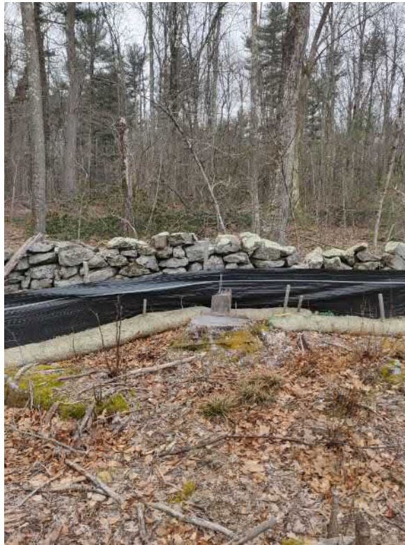
View of damaged silt fence in eastern portion of the Site —facing east