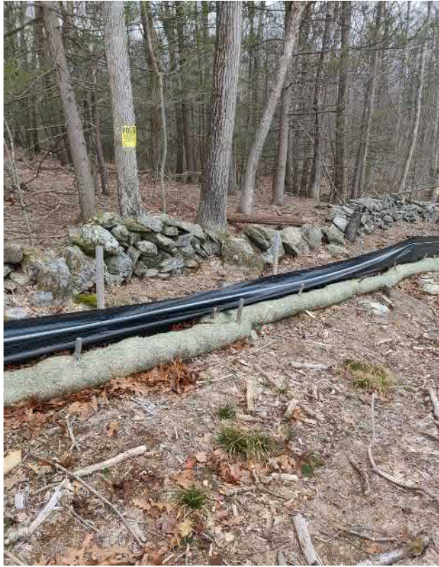
View of the damaged silt fence in eastern portion of Site — facing south east.