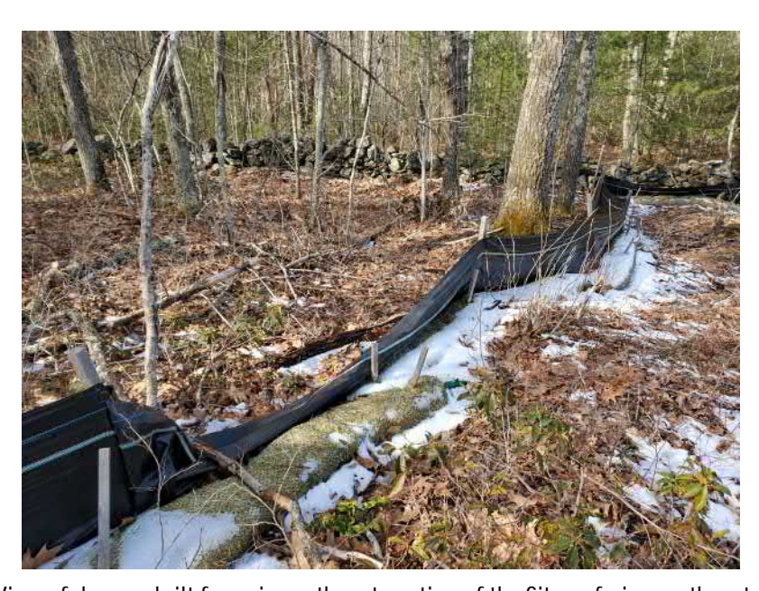
View of damaged silt fence in south east portion of the Site —facing south east

PHOTOGRAPHIC DOCUMENTATION North Sturbridge Road Solar Facility Charlton, Massachusetts Photographs Documented 03.15.2022