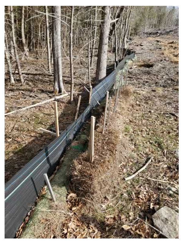
View of area downgradient of Discharge 2—facing north west.