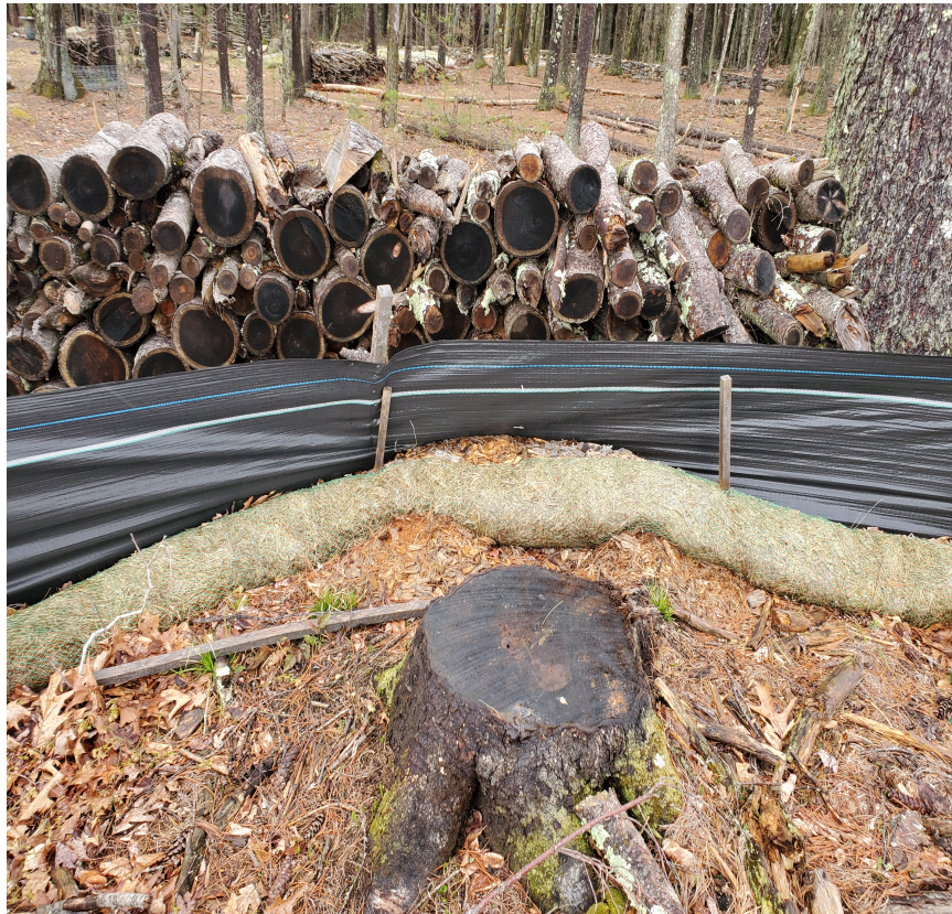
View of damaged silt wattle in northern portion of the Site —facing north

PHOTOGRAPHIC DOCUMENTATION North Sturbridge Road Solar Facility Charlton, Massachusetts Photographs Documented 04.19.2022