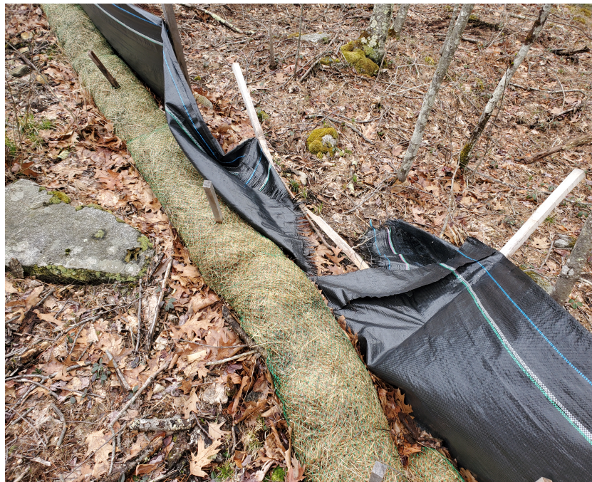
View of damaged silt fence in south east portion of the Site —facing northeast

PHOTOGRAPHIC DOCUMENTATION North Sturbridge Road Solar Facility Charlton, Massachusetts Photographs Documented 04.19.2022