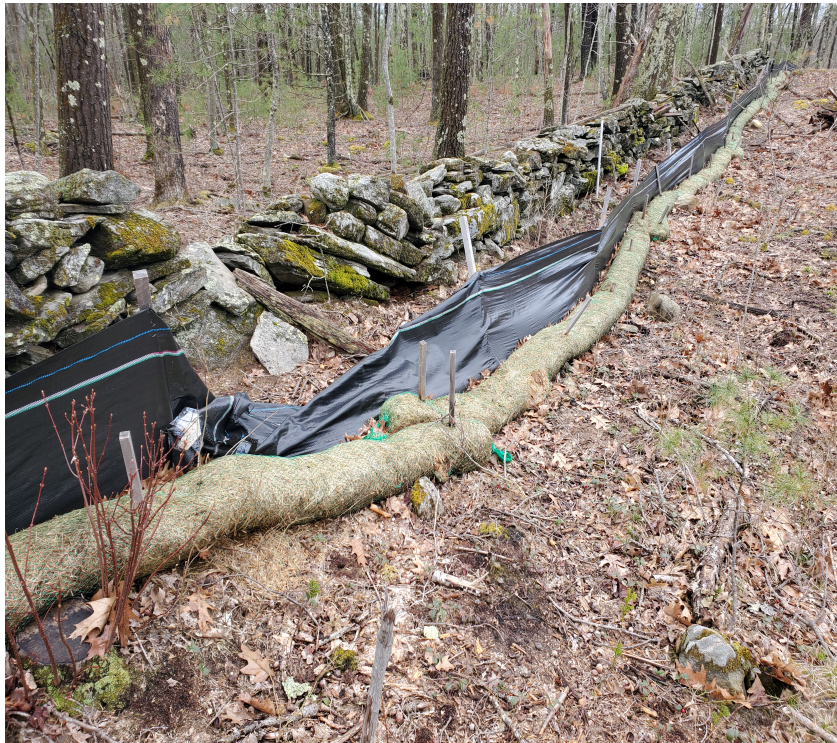
View of damaged silt fence in eastern portion of the Site —facing southeast