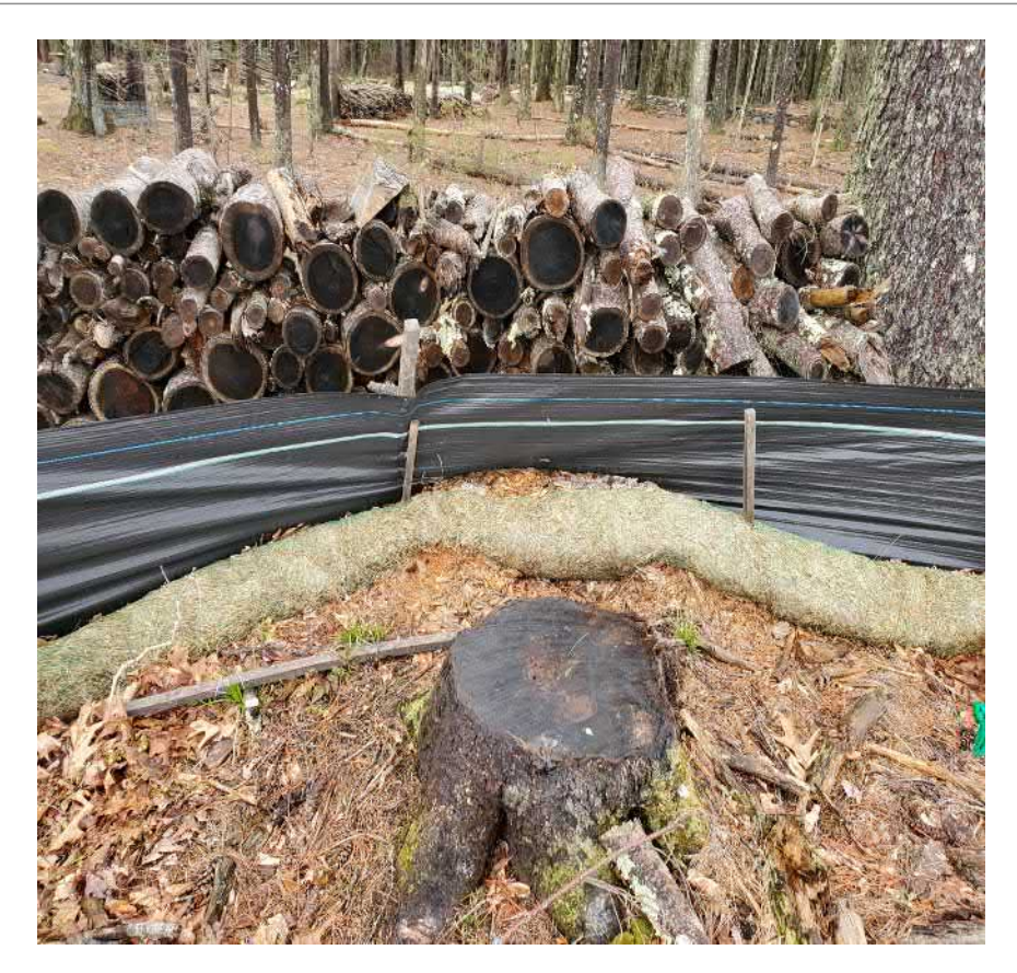
View of damaged wattle in northern portion of the Site —facing north

PHOTOGRAPHIC DOCUMENTATION North Sturbridge Road Solar Facility Charlton, Massachusetts Photographs Documented 04.19.2022