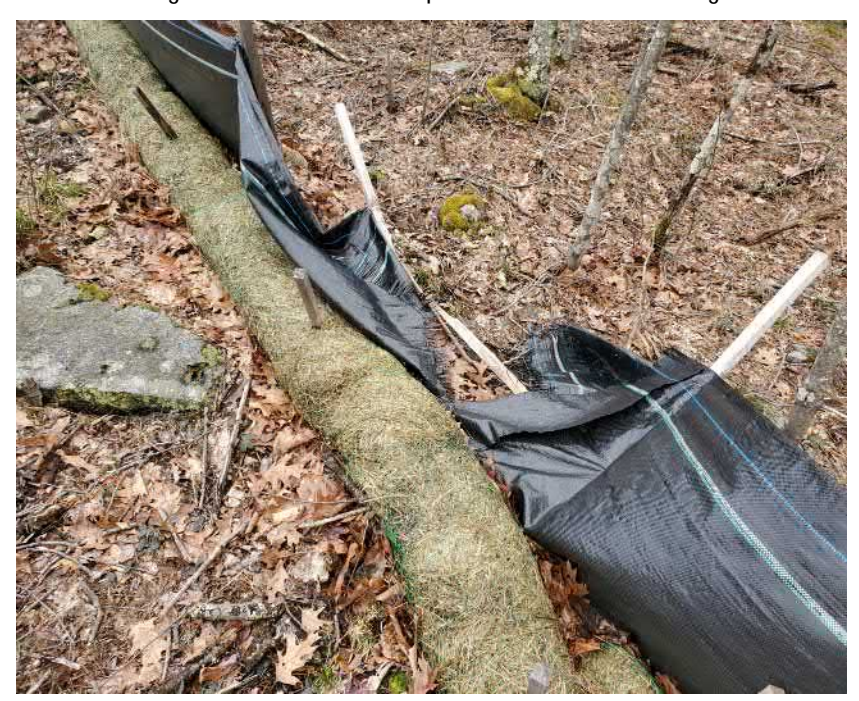
View of damaged silt fence in southeast portion of the Site —facing northeast

PHOTOGRAPHIC DOCUMENTATION North Sturbridge Road Solar Facility Charlton, Massachusetts Photographs Documented 04.19.2022