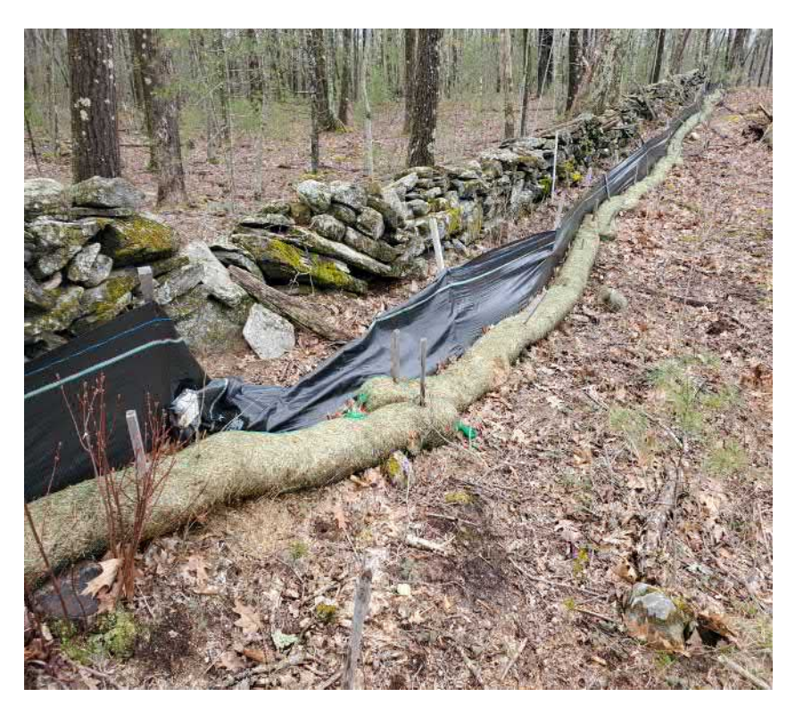
View of damaged silt fence in eastern portion of the Site —facing southeast