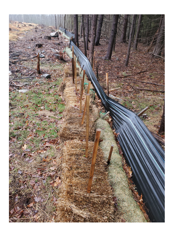
View of area downgradient of Discharge 2—facing south west.