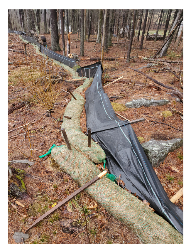
View of damaged silt fence in northern portion of the Site—facing north west.