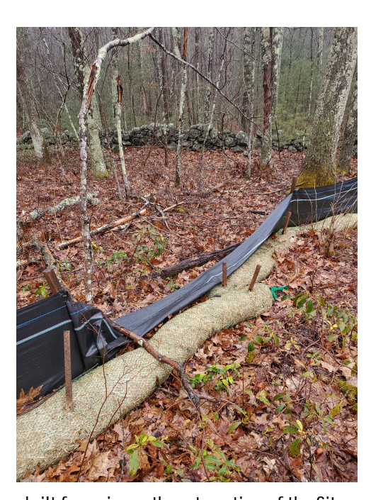
View of damaged silt fence in south east portion of the Site —facing south east

PHOTOGRAPHIC DOCUMENTATION North Sturbridge Road Solar Facility Charlton, Massachusetts Photographs Documented 03.24.2022