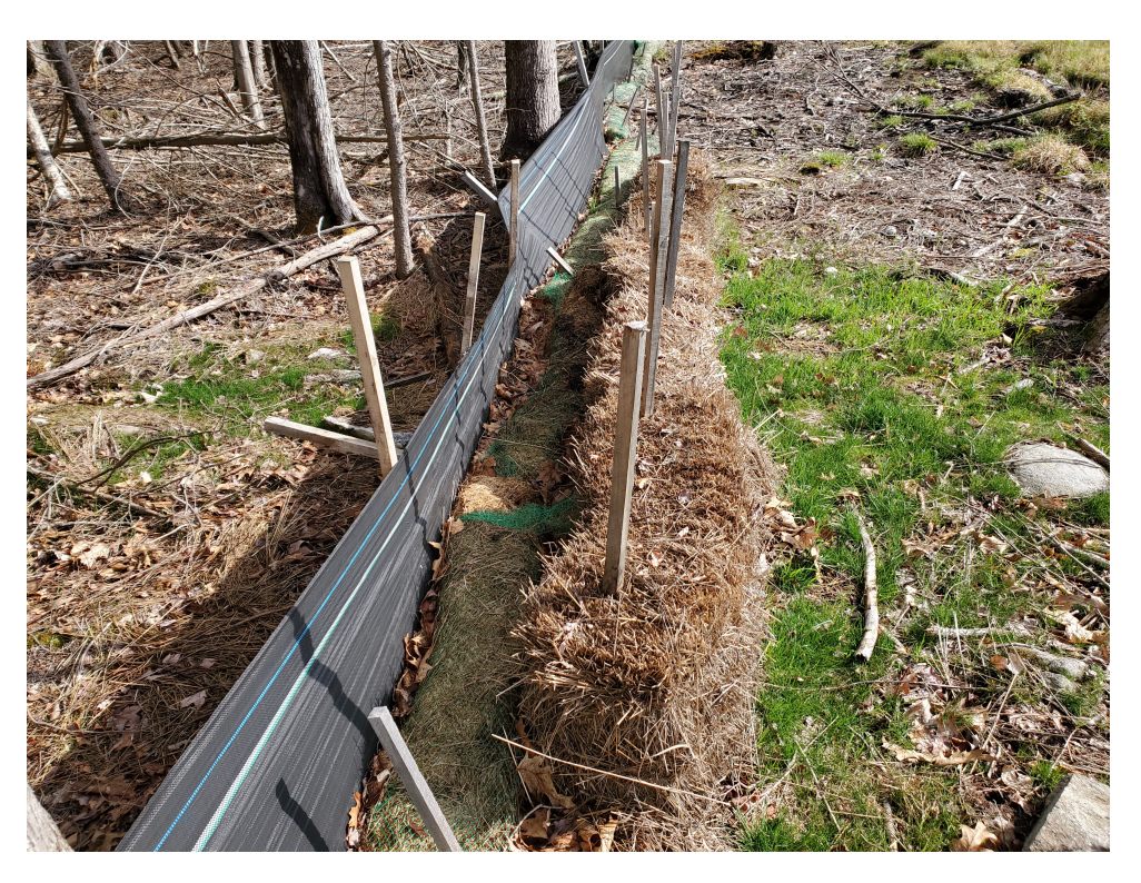
View of seeded grass at Discharge 2 — facing north

PHOTOGRAPHIC DOCUMENTATION North Sturbridge Road Solar Facility Charlton, Massachusetts Photographs Documented 04.27.2022