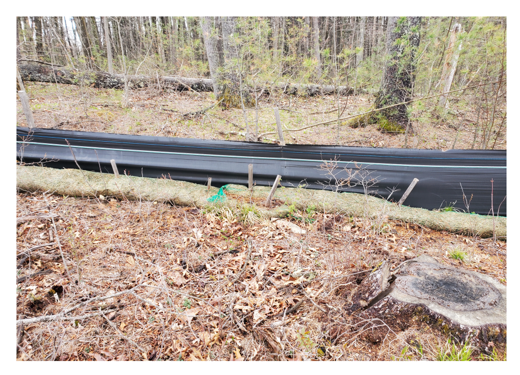
View of damaged silt wattle in northern portion of the Site — facing north