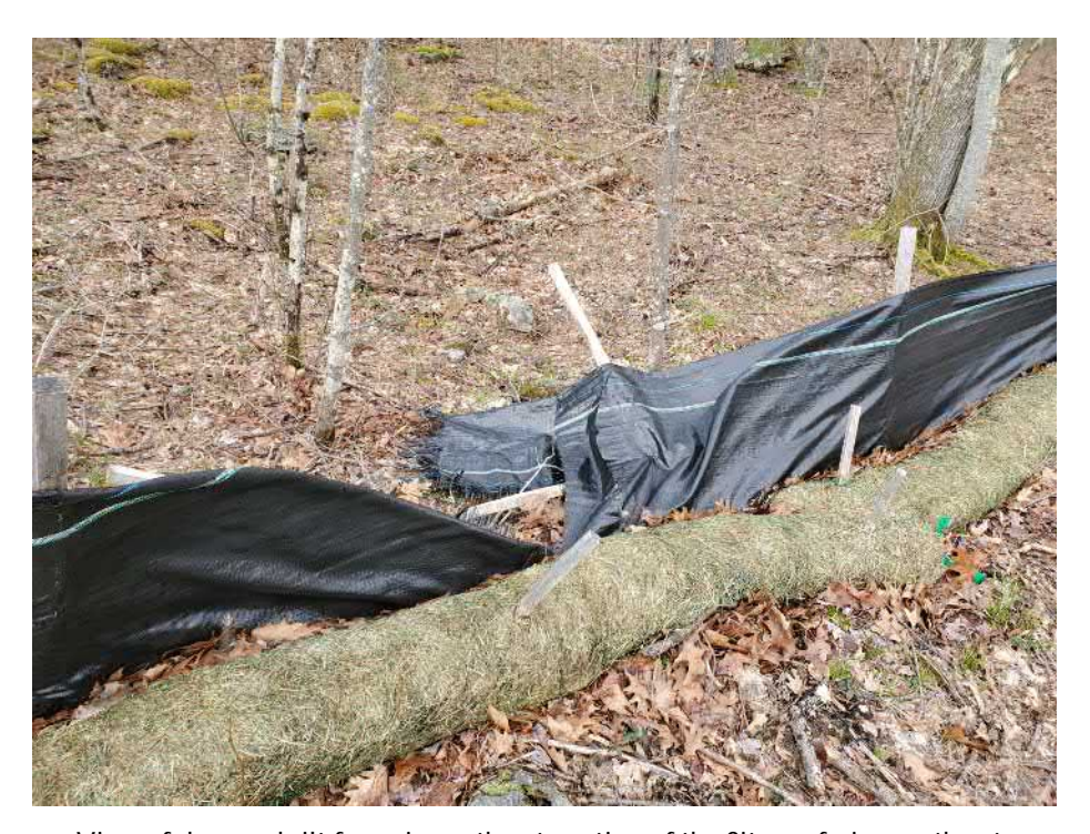
View of damaged silt fence in southeast portion of the Site — facing southeast

PHOTOGRAPHIC DOCUMENTATION North Sturbridge Road Solar Facility Charlton, Massachusetts Photographs Documented 04.27.2022