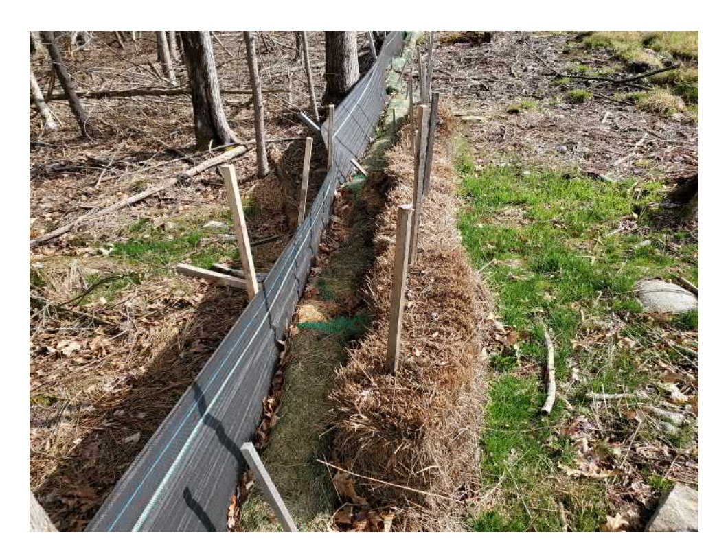
View of established grass at Discharge 2 — facing north

PHOTOGRAPHIC DOCUMENTATION North Sturbridge Road Solar Facility Charlton, Massachusetts Photographs Documented 04.27.2022