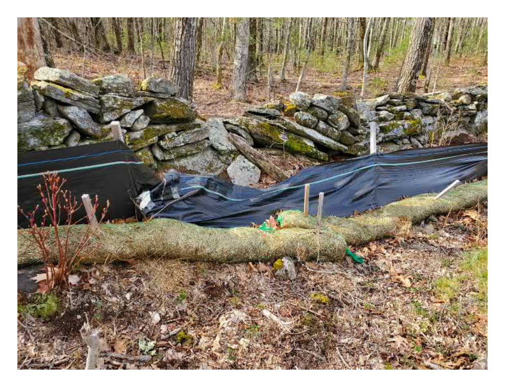
View of damaged silt fence in eastern portion of the Site — facing southeast