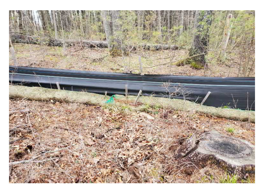
View of damaged silt wattle in northern portion of the Site — facing north