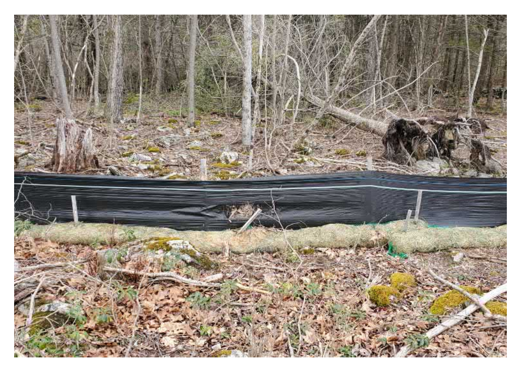
View of damaged silt wattle in northeastern portion of the Site — facing northeast