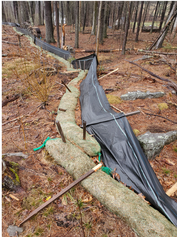
View of damaged silt fence in northern portion of the Site—facing north west.