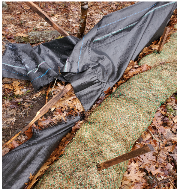
View of damaged silt fence in south east portion of the Site —facing south east

PHOTOGRAPHIC DOCUMENTATION North Sturbridge Road Solar Facility Charlton, Massachusetts Photographs Documented 03.24.2022