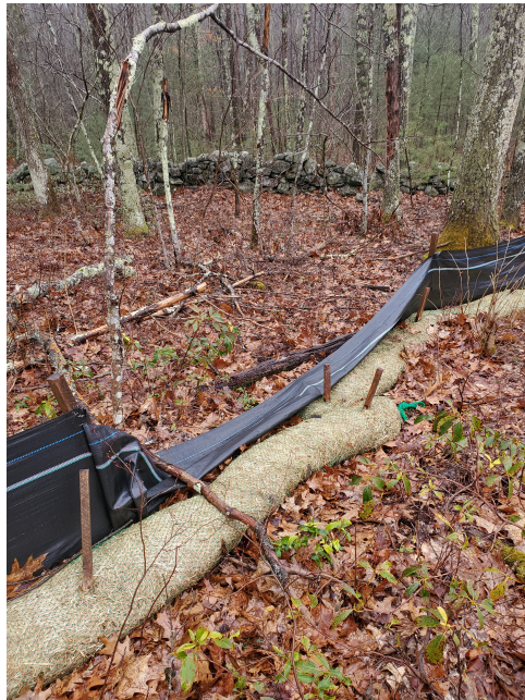
View of damaged silt fence in south east portion of the Site —facing south east

PHOTOGRAPHIC DOCUMENTATION North Sturbridge Road Solar Facility Charlton, Massachusetts Photographs Documented 03.24.2022