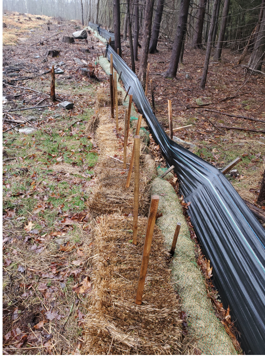
View of area downgradient of Discharge 2—facing south west.