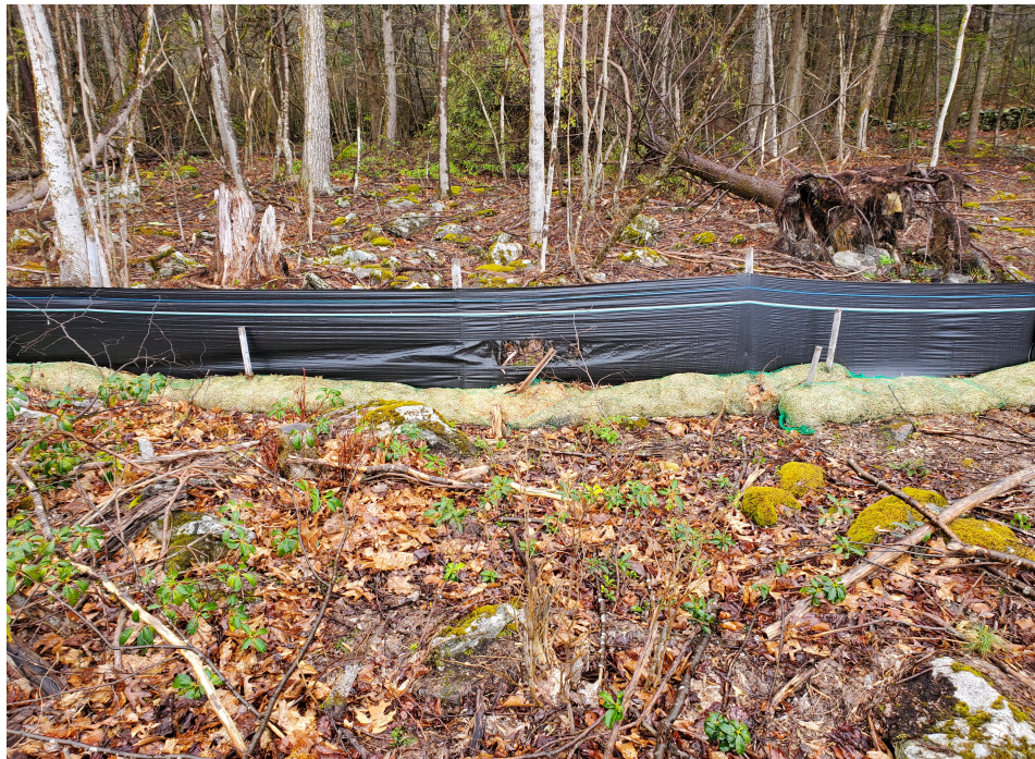
View of damaged silt wattle in northeastern portion of the Site — facing northeast

PHOTOGRAPHIC DOCUMENTATION North Sturbridge Road Solar Facility Charlton, Massachusetts Photographs Documented 5.4.2022