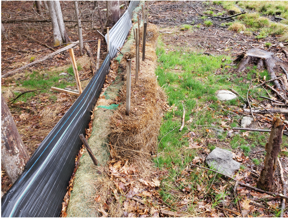
View of seeded grass at Discharge 2 — facing north

PHOTOGRAPHIC DOCUMENTATION North Sturbridge Road Solar Facility Charlton, Massachusetts Photographs Documented 5.4.2022