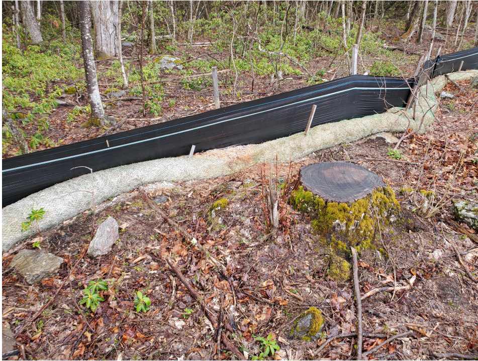
View of damaged silt wattle in northern portion of the Site — facing north