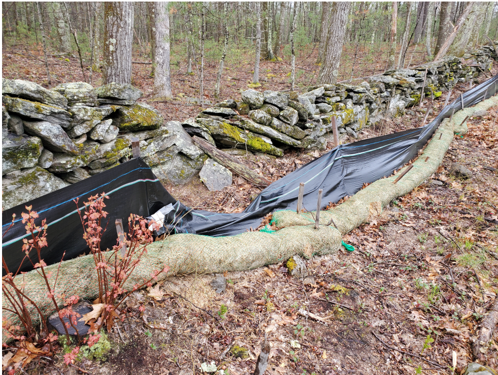
View of damaged silt fence in eastern portion of the Site — facing southeast