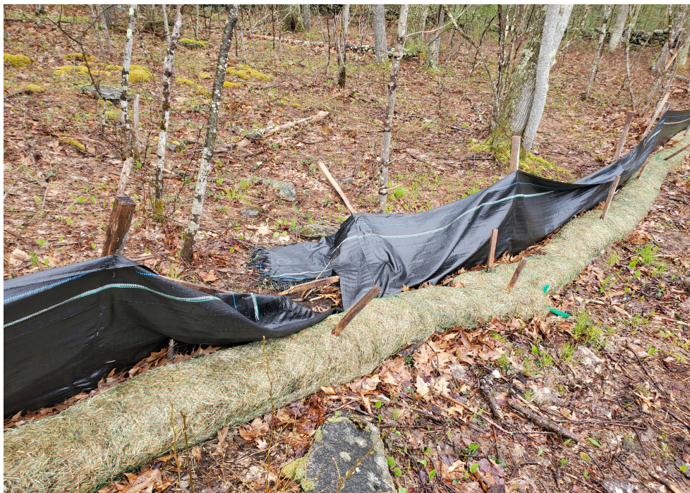
View of damaged silt fence in southeast portion of the Site — facing southeast

PHOTOGRAPHIC DOCUMENTATION North Sturbridge Road Solar Facility Charlton, Massachusetts Photographs Documented 5.4.2022