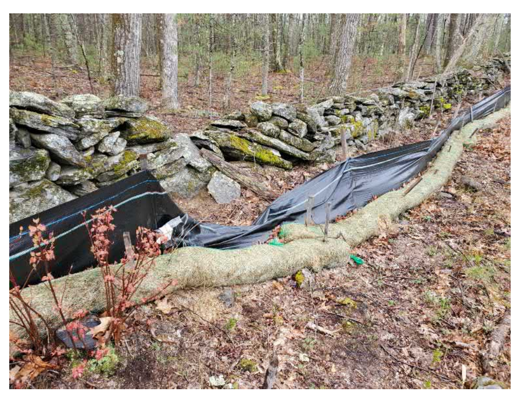
View of damaged silt fence in eastern portion of the Site — facing southeast