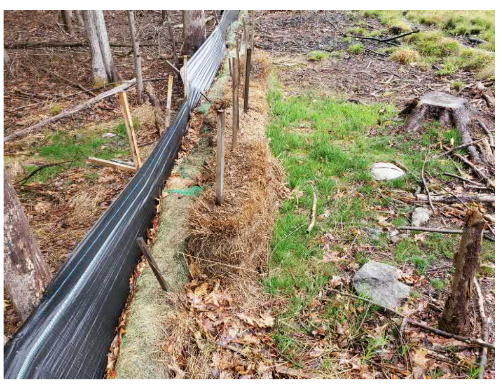
View of planted grass at Discharge 2 — facing north

PHOTOGRAPHIC DOCUMENTATION North Sturbridge Road Solar Facility Charlton, Massachusetts Photographs Documented 5.4.2022