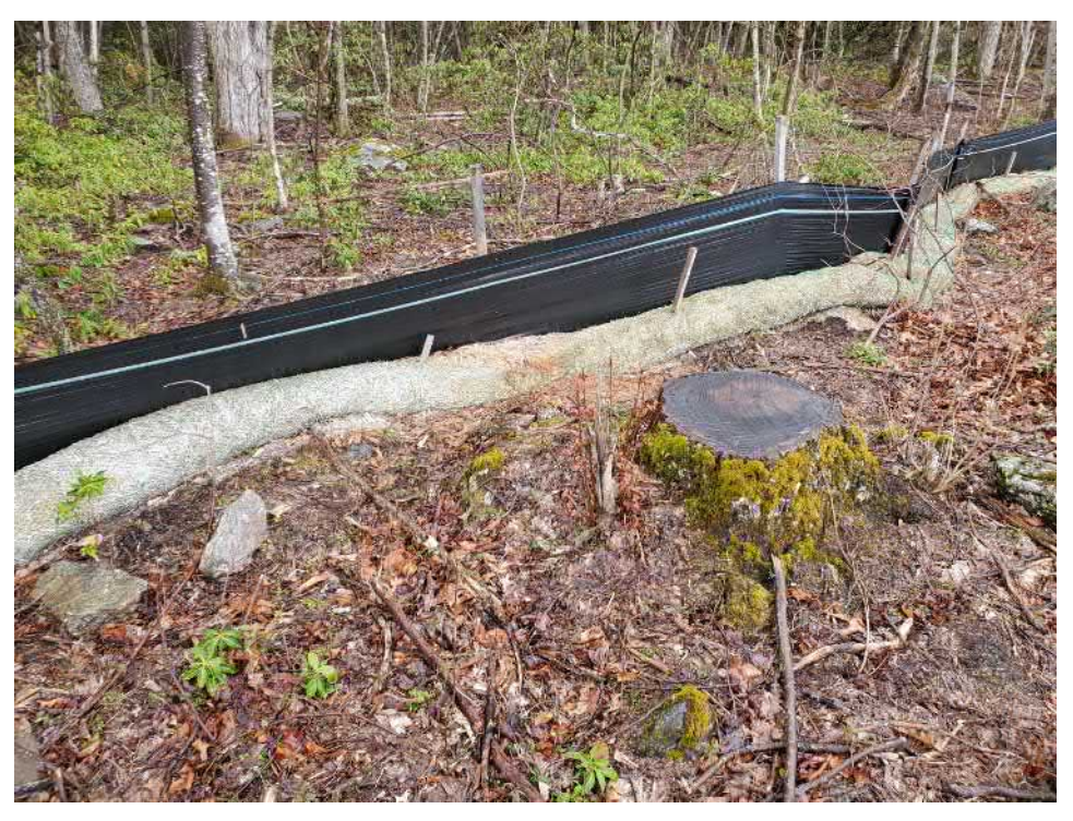
View of damaged silt wattle in northern portion of the Site — facing north