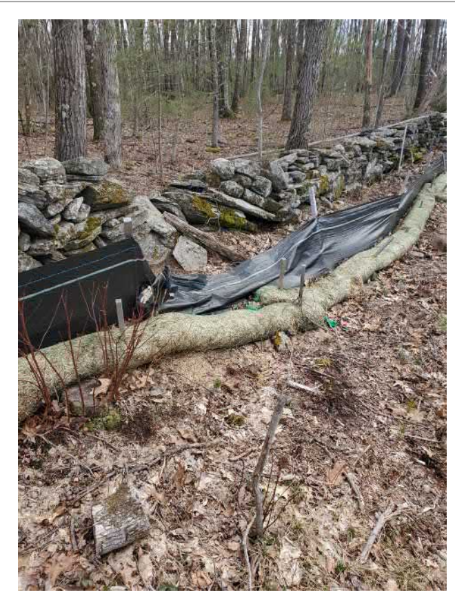
View of damaged silt fence in eastern portion of the Site —facing south east