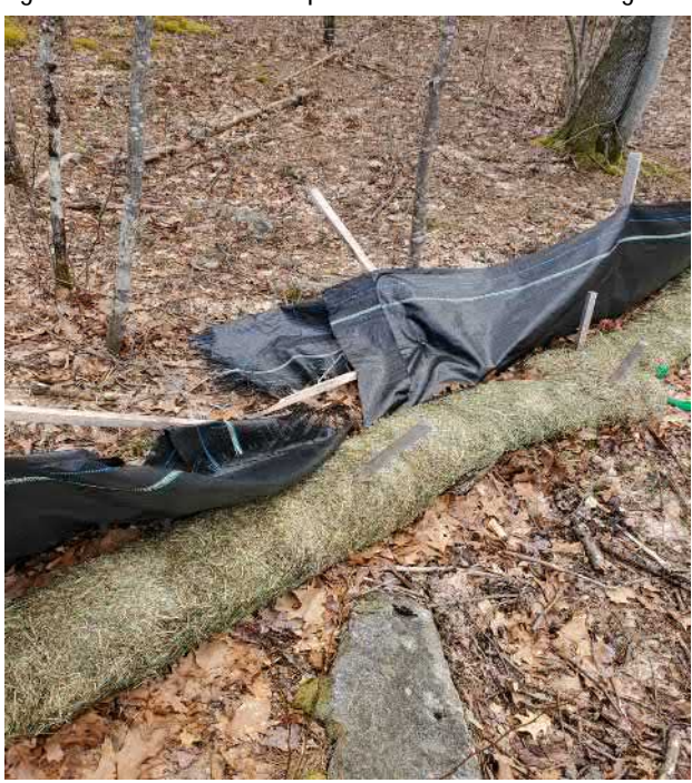
View of damaged silt fence in south east portion of the Site —facing south east

PHOTOGRAPHIC DOCUMENTATION North Sturbridge Road Solar Facility Charlton, Massachusetts Photographs Documented 04.8.2022