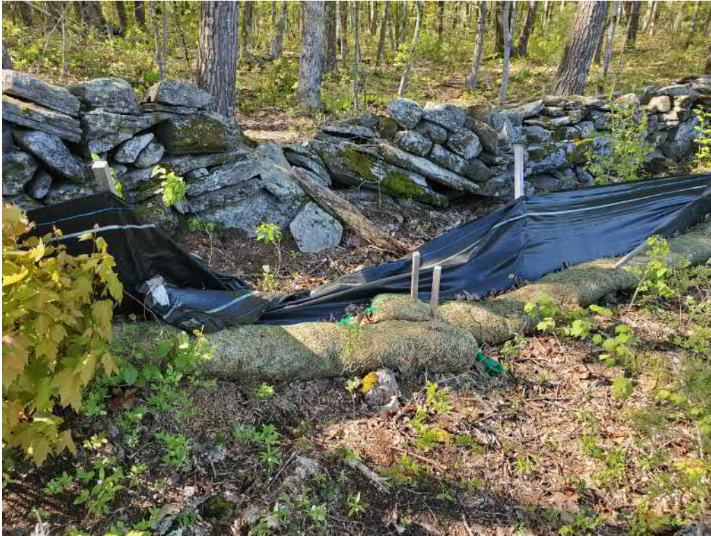
View of damaged silt fence in eastern portion of the Site — facing southeast