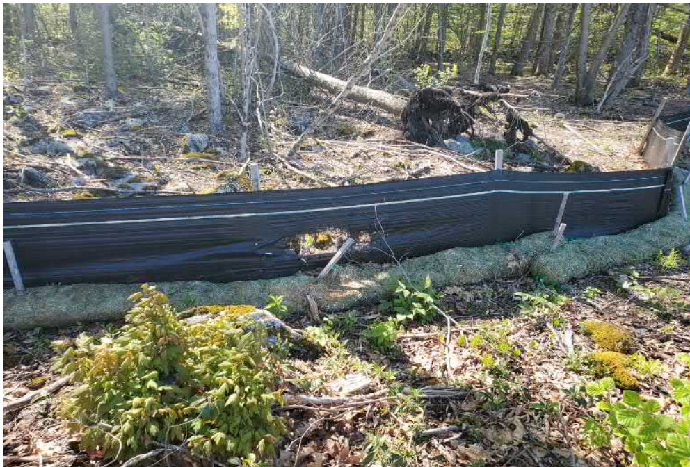
View of damaged silt wattle and silt fence in northeastern portion of the Site — facing northeast

PHOTOGRAPHIC DOCUMENTATION North Sturbridge Road Solar Facility Charlton, Massachusetts Photographs Documented 5.17.2022