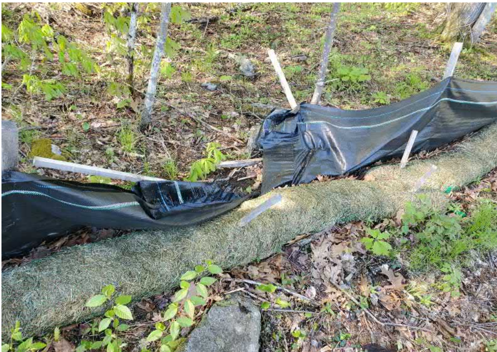
View of damaged silt fence in southeast portion of the Site — facing southeast

PHOTOGRAPHIC DOCUMENTATION North Sturbridge Road Solar Facility Charlton, Massachusetts Photographs Documented 5.17.2022