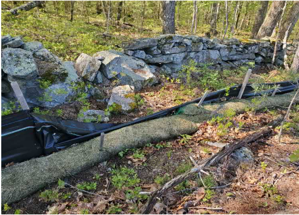
View of damaged silt fence in southeast portion of the Site — facing southeast

PHOTOGRAPHIC DOCUMENTATION North Sturbridge Road Solar Facility Charlton, Massachusetts Photographs Documented 5.17.2022