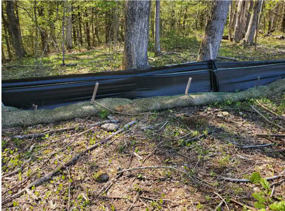
View of damaged silt wattle in northern portion of the Site — facing north