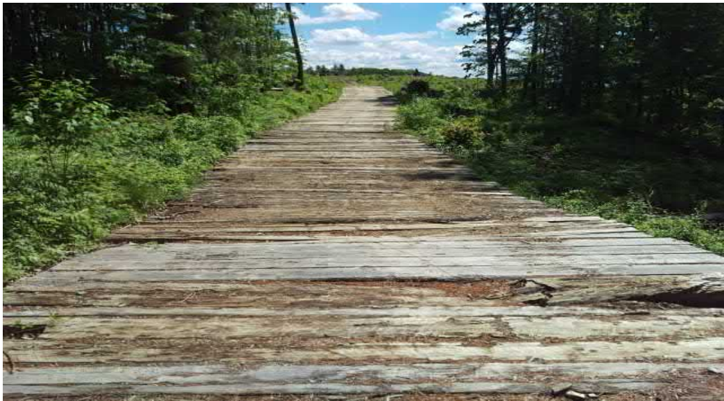
View of construction entrance timber mats — facing south

PHOTOGRAPHIC DOCUMENTATION North Sturbridge Road Solar Facility Charlton, Massachusetts Photographs Documented 5.29.2022