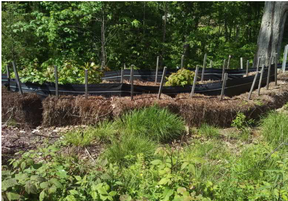
View of intact hay bales in northern portion of the Site — facing north

PHOTOGRAPHIC DOCUMENTATION North Sturbridge Road Solar Facility Charlton, Massachusetts Photographs Documented 5.29.2022