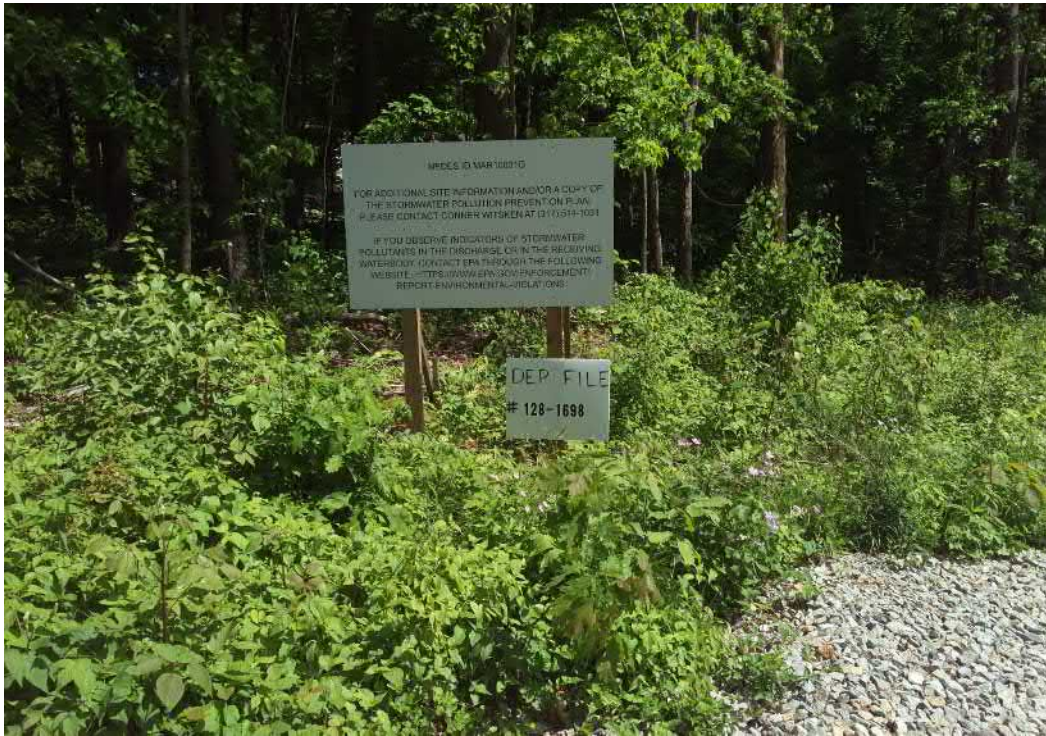
View of NPDES signage at entrance — facing southeast