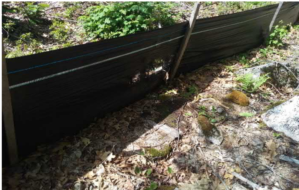
View of damaged silt fence northeastern portion of the Site — facing northwest

PHOTOGRAPHIC DOCUMENTATION North Sturbridge Road Solar Facility Charlton, Massachusetts Photographs Documented 5.29.2022