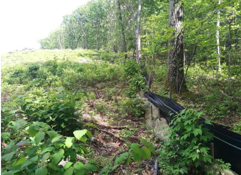
View of damaged silt fence southern portion of the Site — facing east