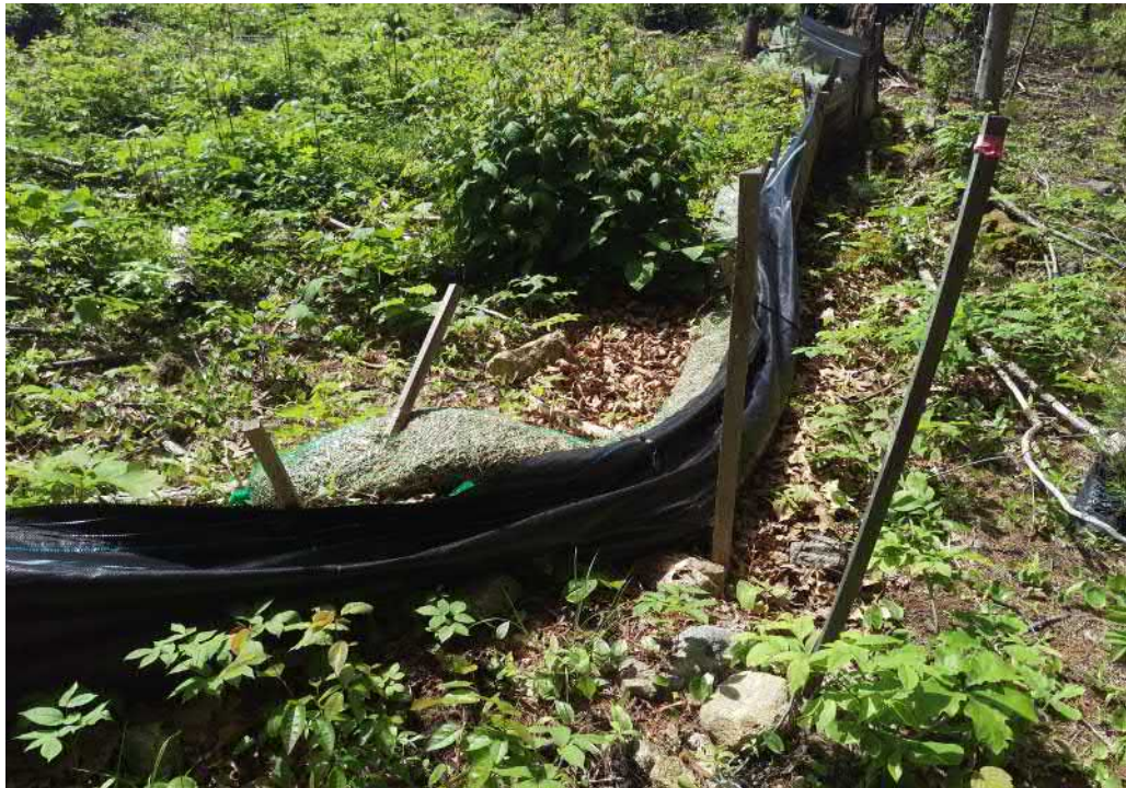
View of damaged silt fence in northern portion of the Site — facing north