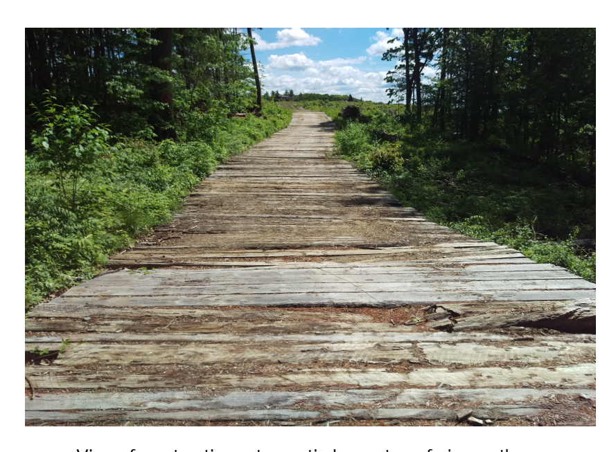
View of construction entrance timber mats — facing south

PHOTOGRAPHIC DOCUMENTATION North Sturbridge Road Solar Facility Charlton, Massachusetts Photographs Documented 5.29.2022