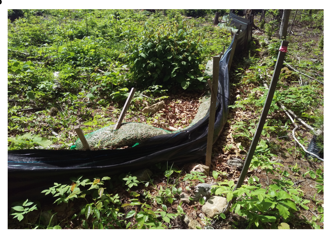
View of damaged silt fence in northern portion of the Site — facing north