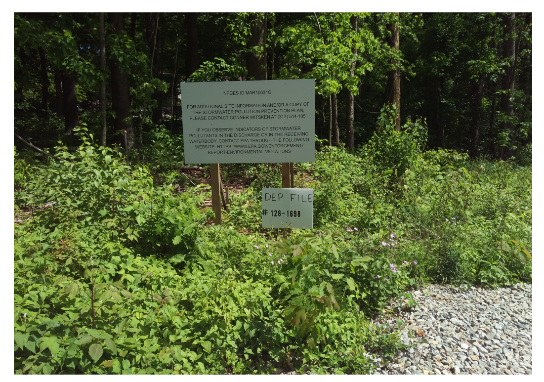
View of NPDES signage at entrance — facing southeast