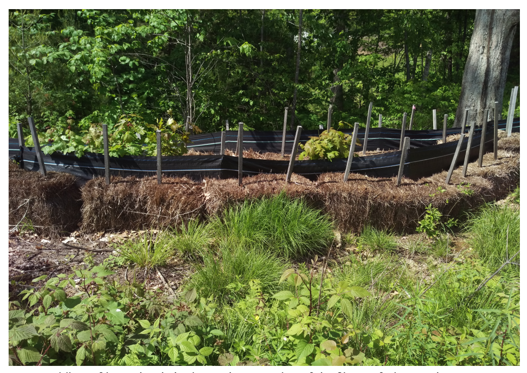
View of intact hay bales in northern portion of the Site — facing north

PHOTOGRAPHIC DOCUMENTATION North Sturbridge Road Solar Facility Charlton, Massachusetts Photographs Documented 5.29.2022