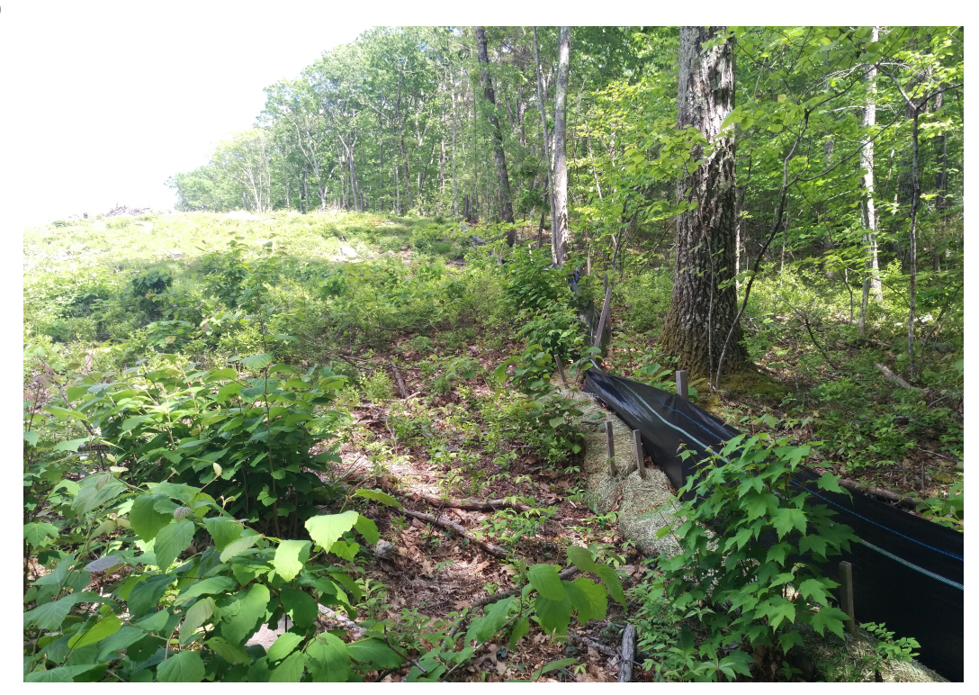
View of damaged silt fence southern portion of the Site — facing east