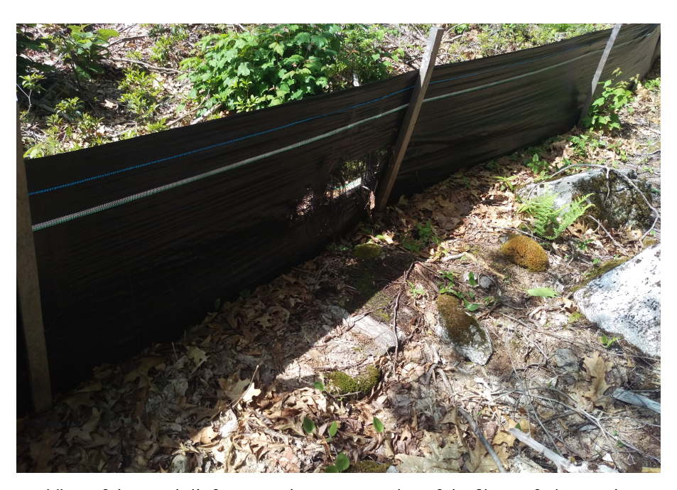
View of damaged silt fence north eastern portion of the Site — facing northwest

PHOTOGRAPHIC DOCUMENTATION North Sturbridge Road Solar Facility Charlton, Massachusetts Photographs Documented 5.29.2022