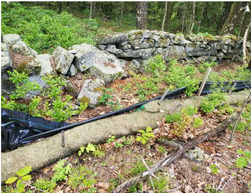
View of damaged silt fence in southeast portion of the Site — facing southeast