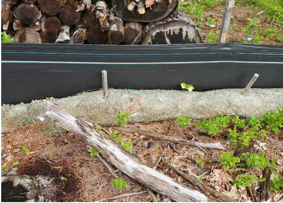
View of damaged silt wattle in northern portion of the Site — facing north