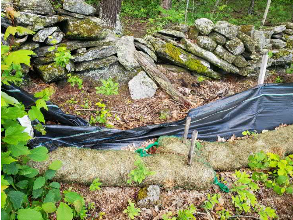
View of damaged silt fence in eastern portion of the Site — facing southeast