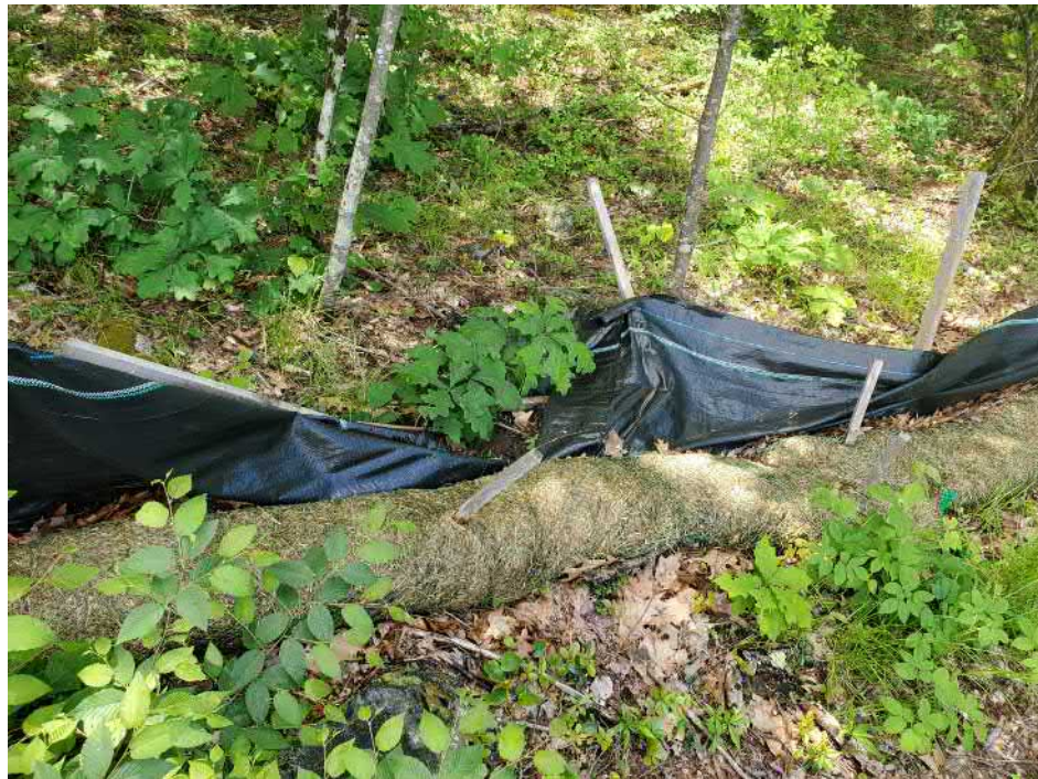
View of damaged silt fence in southeast portion of the Site — facing southeast

PHOTOGRAPHIC DOCUMENTATION North Sturbridge Road Solar Facility Charlton, Massachusetts Photographs Documented 6.9.2022