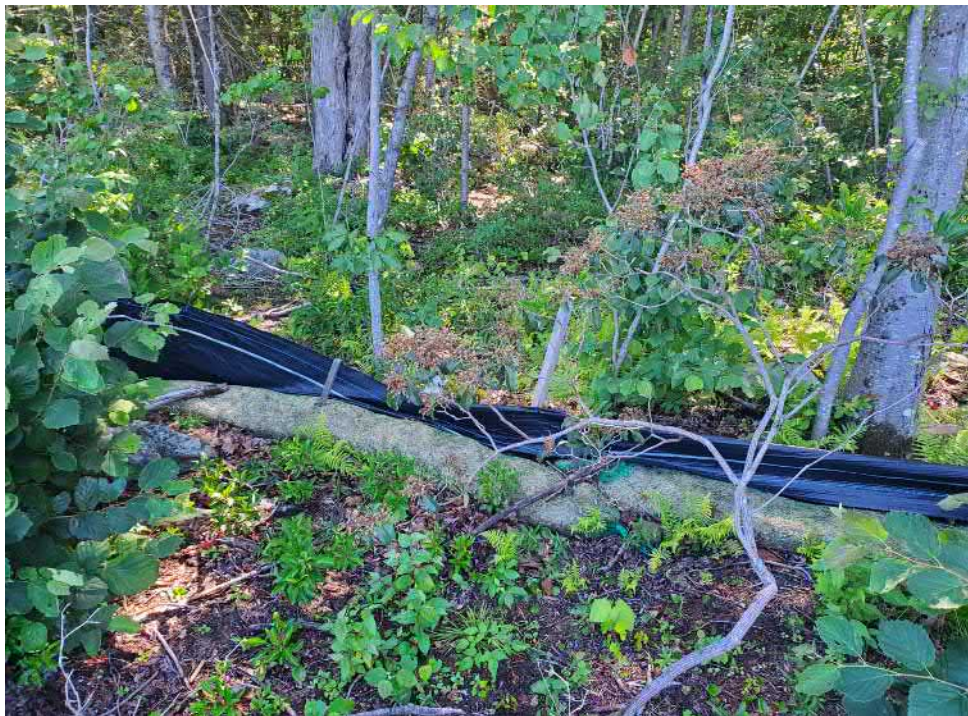
View of damaged silt fence in southeast portion of the Site — facing northeast

PHOTOGRAPHIC DOCUMENTATION North Sturbridge Road Solar Facility Charlton, Massachusetts Photographs Documented 7.13.2022