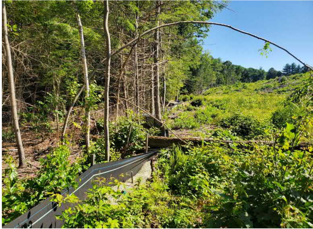
View of fallen tree damage to silt fence in southwestern portion of the Site — facing north