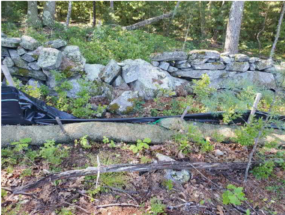
View of damaged silt fence in northeastern portion of the Site — facing east