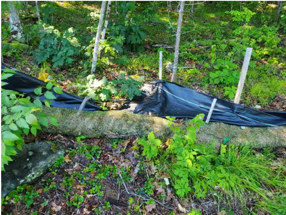
View of damaged silt fence in southeastern portion of the Site — facing northeast