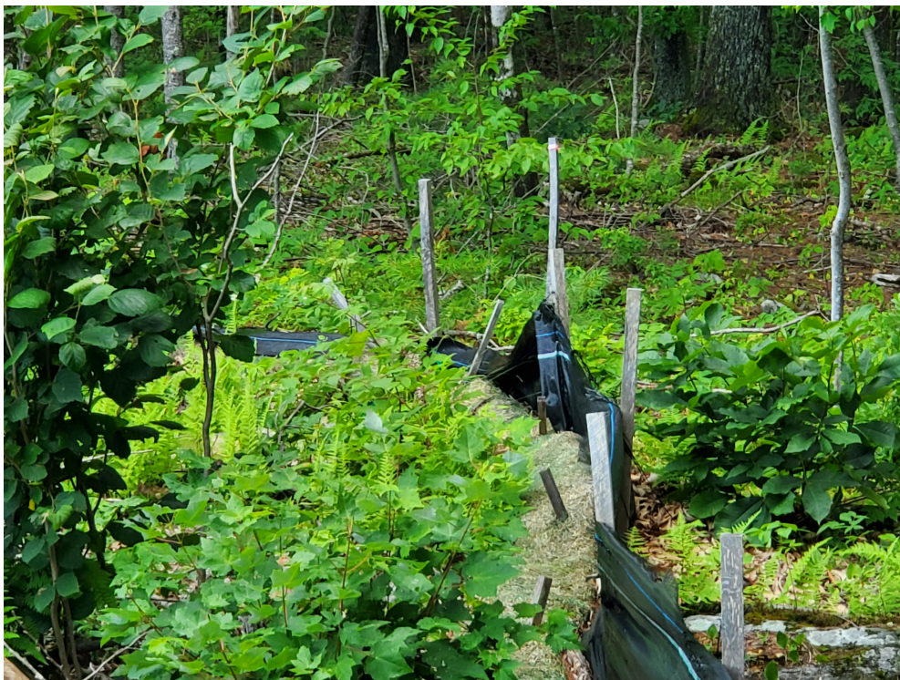
View of damaged silt fence in northeast portion of the Site — facing northeast

PHOTOGRAPHIC DOCUMENTATION North Sturbridge Road Solar Facility Charlton, Massachusetts Photographs Documented 7.14.2022