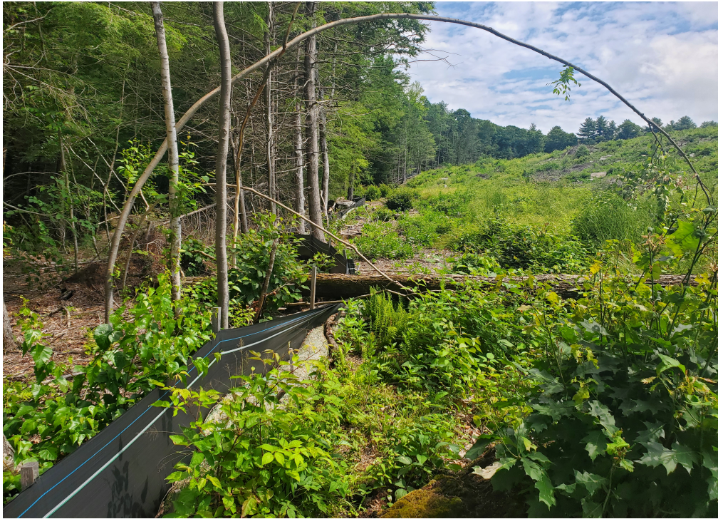
View of fallen tree damage to silt fence in southwestern portion of the Site — facing north