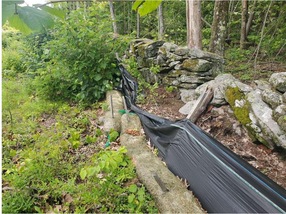
View of damaged silt fence in northeastern portion of the Site — facing east