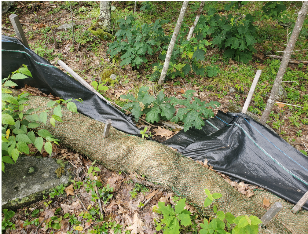
View of damaged silt fence in southeastern portion of the Site — facing northeast