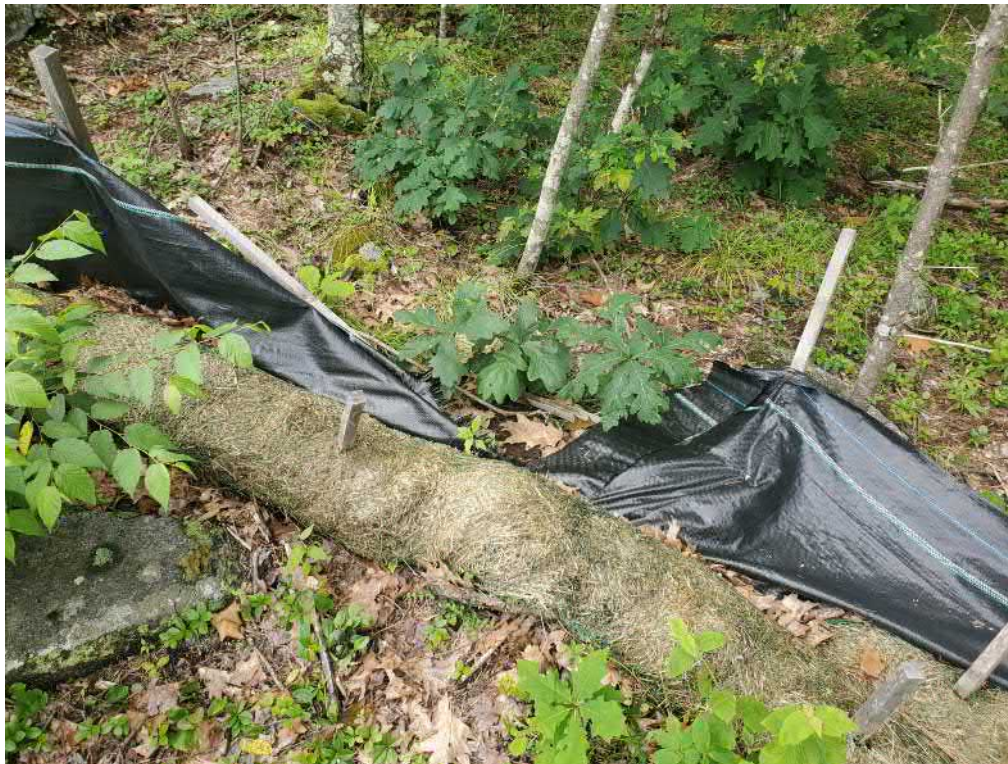
View of damaged silt fence in southeastern portion of the Site — facing northeast