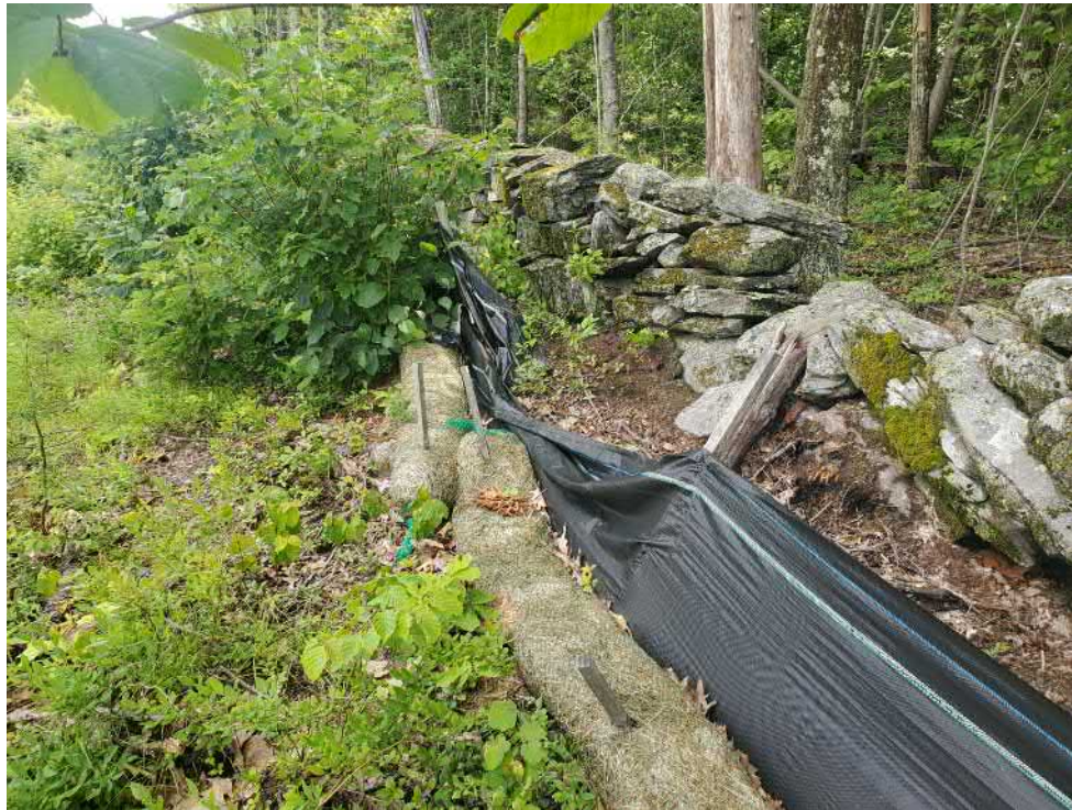
View of damaged silt fence in northeastern portion of the Site — facing east