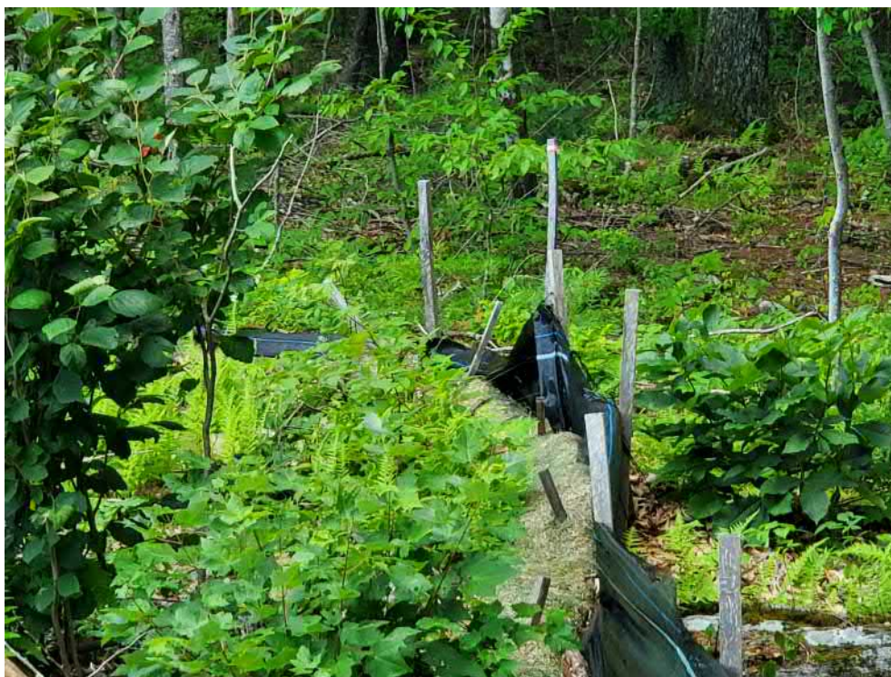
View of damaged silt fence in northeast portion of the Site — facing northeast

PHOTOGRAPHIC DOCUMENTATION North Sturbridge Road Solar Facility Charlton, Massachusetts Photographs Documented 7.14.2022