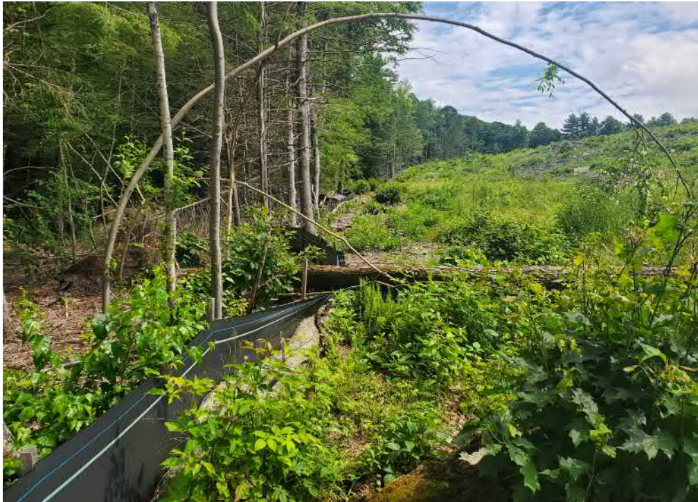
View of fallen tree damage to silt fence in southwestern portion of the Site — facing north