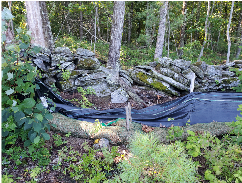
View of damaged silt fence in northeastern portion of the Site — facing east