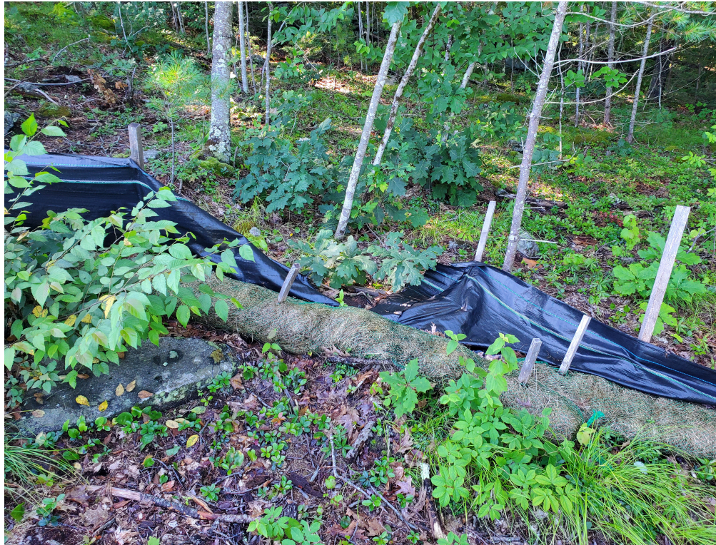
View of damaged silt fence in southeastern portion of the Site — facing northeast