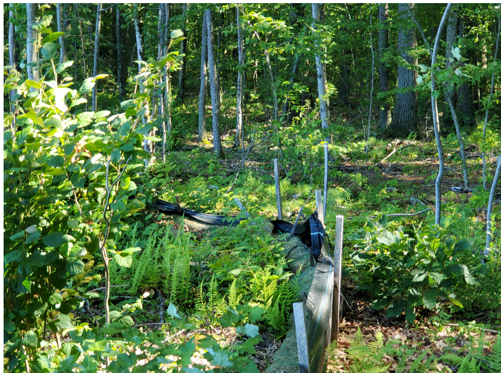
View of damaged silt fence in northeast portion of the Site — facing northeast

PHOTOGRAPHIC DOCUMENTATION North Sturbridge Road Solar Facility Charlton, Massachusetts Photographs Documented 7.19.2022