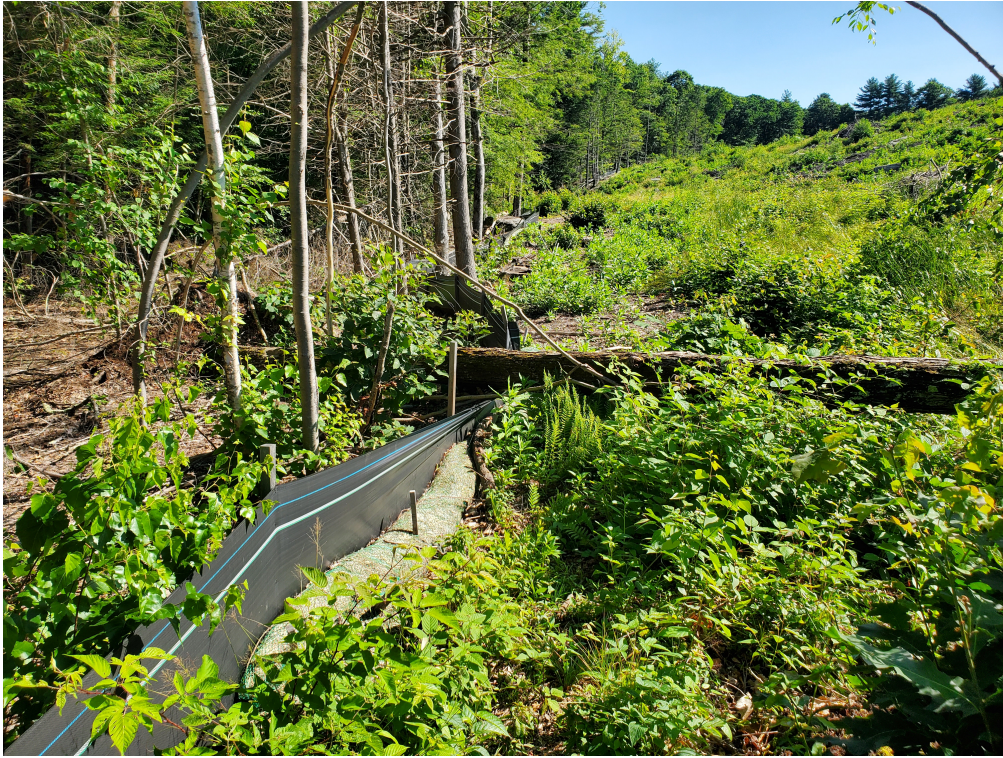
View of fallen tree damage to silt fence in southwestern portion of the Site — facing north