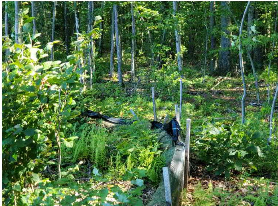
View of damaged silt fence in northeast portion of the Site — facing northeast

PHOTOGRAPHIC DOCUMENTATION North Sturbridge Road Solar Facility Charlton, Massachusetts Photographs Documented 7.19.2022