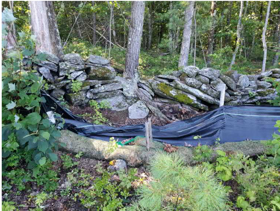
View of damaged silt fence in northeastern portion of the Site — facing east