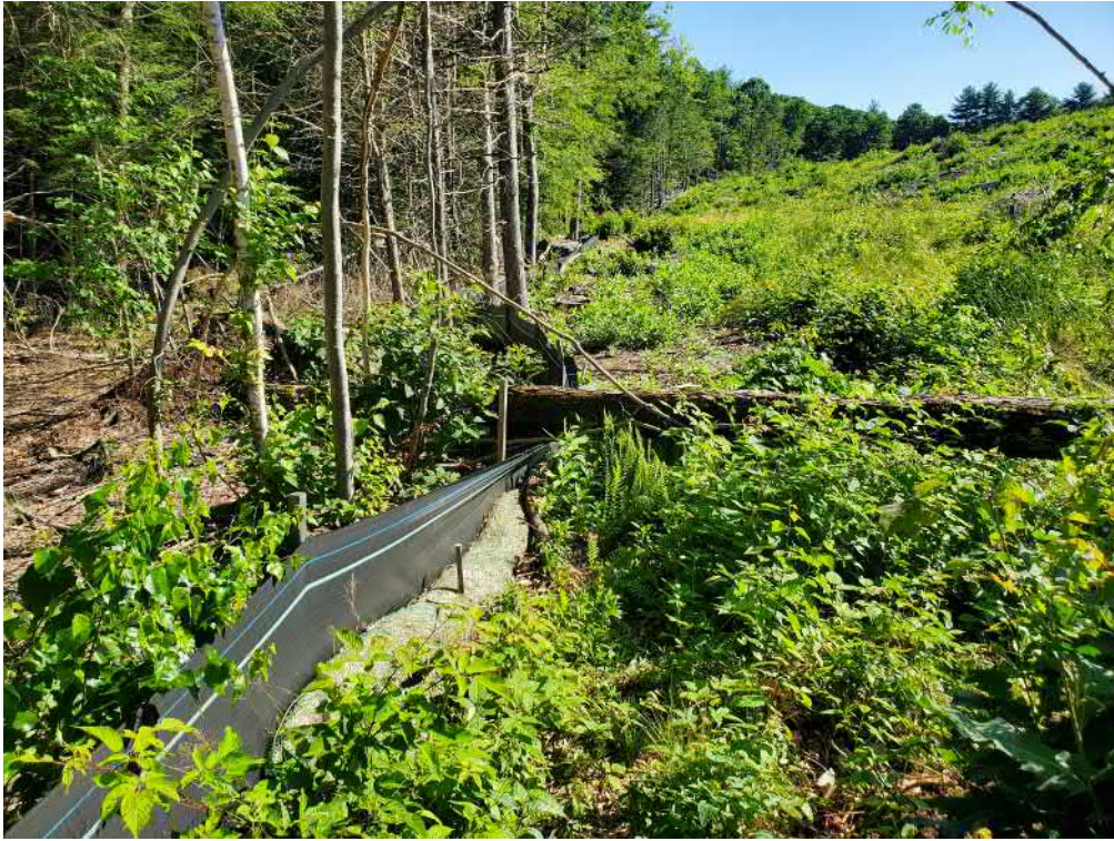
View of fallen tree damage to silt fence in southwestern portion of the Site — facing north