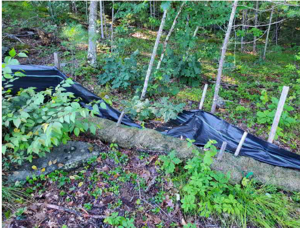
View of damaged silt fence in southeastern portion of the Site — facing northeast