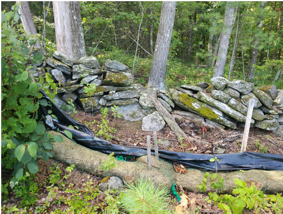
View of damaged silt fence in northeastern portion of the Site — facing east