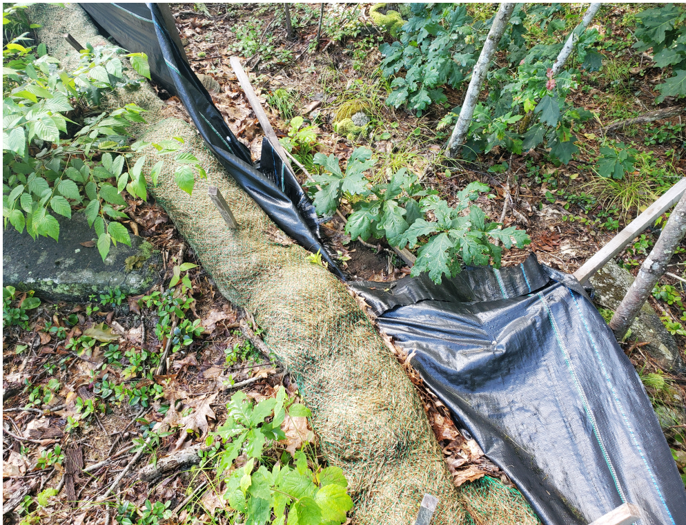
View of damaged silt fence in southeastern portion of the Site — facing northeast