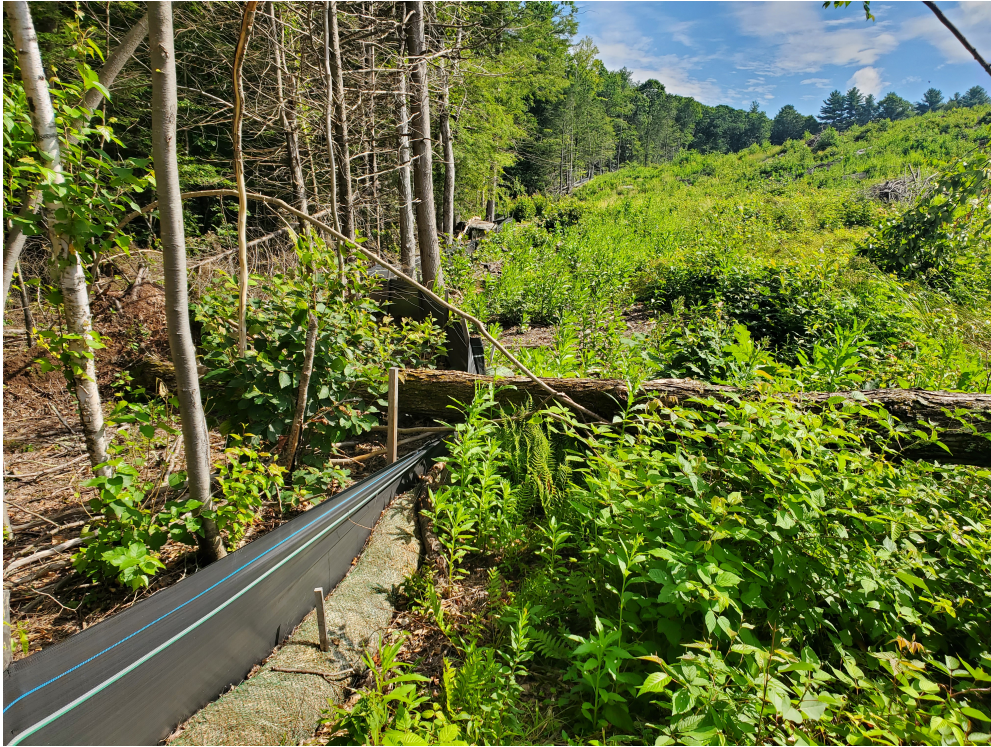
View of fallen tree damage to silt fence in southwestern portion of the Site — facing north