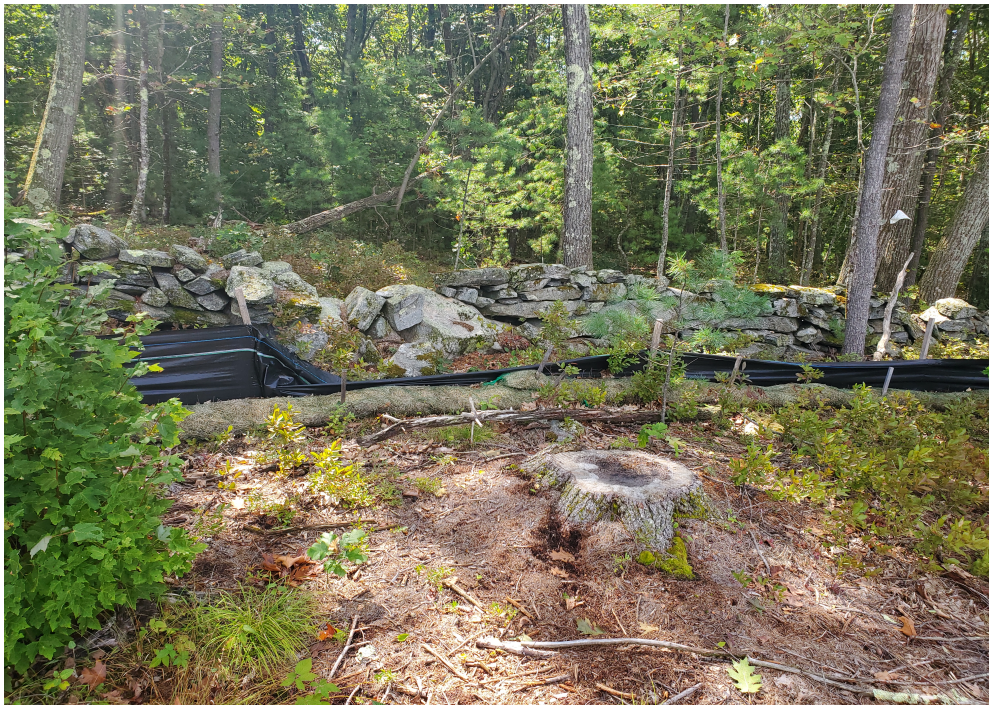
View of damaged silt fence in northeastern portion of the Site — facing east