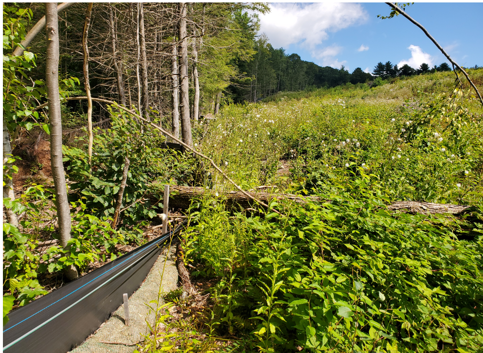
View of fallen tree damage to silt fence in southwestern portion of the Site — facing north