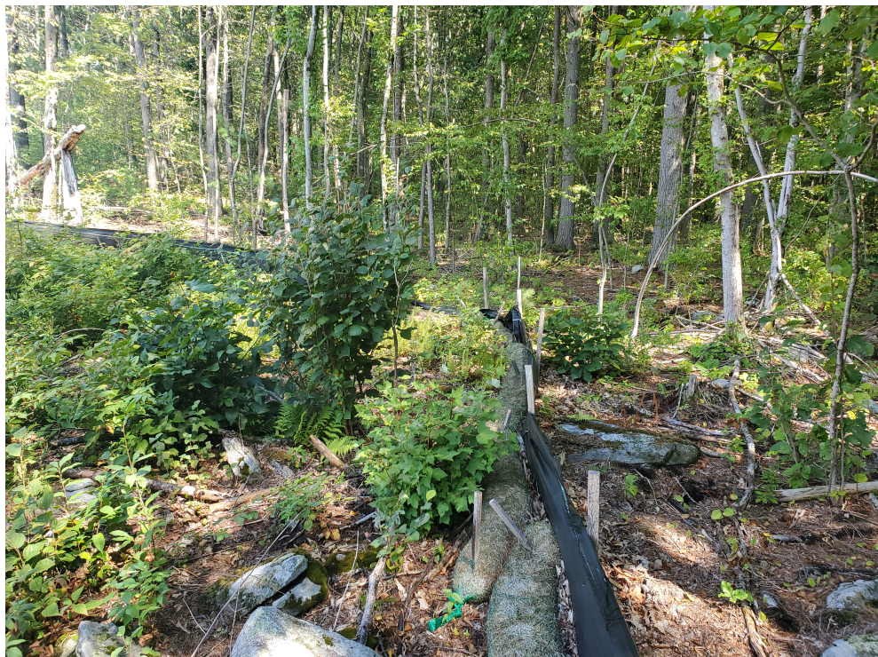
View of damaged silt fence in northeast portion of the Site — facing northeast

PHOTOGRAPHIC DOCUMENTATION North Sturbridge Road Solar Facility Charlton, Massachusetts Photographs Documented 8.31.2022