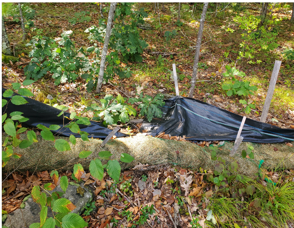
View of damaged silt fence in southeastern portion of the Site — facing northeast

PHOTOGRAPHIC DOCUMENTATION North Sturbridge Road Solar Facility Charlton, Massachusetts Photographs Documented 8.31.2022