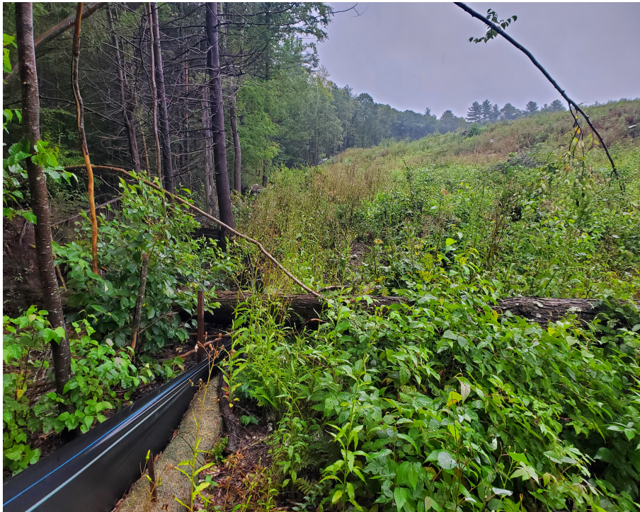
View of fallen tree damage to silt fence in southwestern portion of the Site — facing north