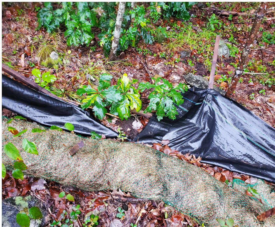
View of damaged silt fence in southeastern portion of the Site — facing northeast

PHOTOGRAPHIC DOCUMENTATION North Sturbridge Road Solar Facility Charlton, Massachusetts Photographs Documented 9.6.2022