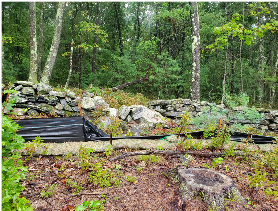
View of damaged silt fence in northeastern portion of the Site — facing east