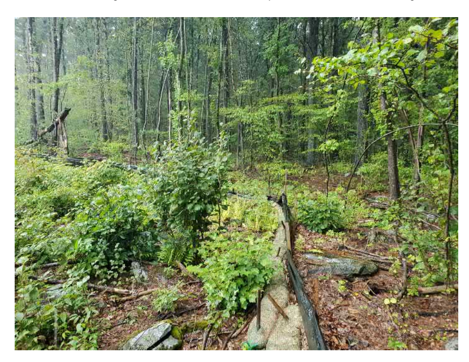
View of damaged silt fence in northeast portion of the Site — facing northeast

PHOTOGRAPHIC DOCUMENTATION North Sturbridge Road Solar Facility Charlton, Massachusetts Photographs Documented 9.6.2022