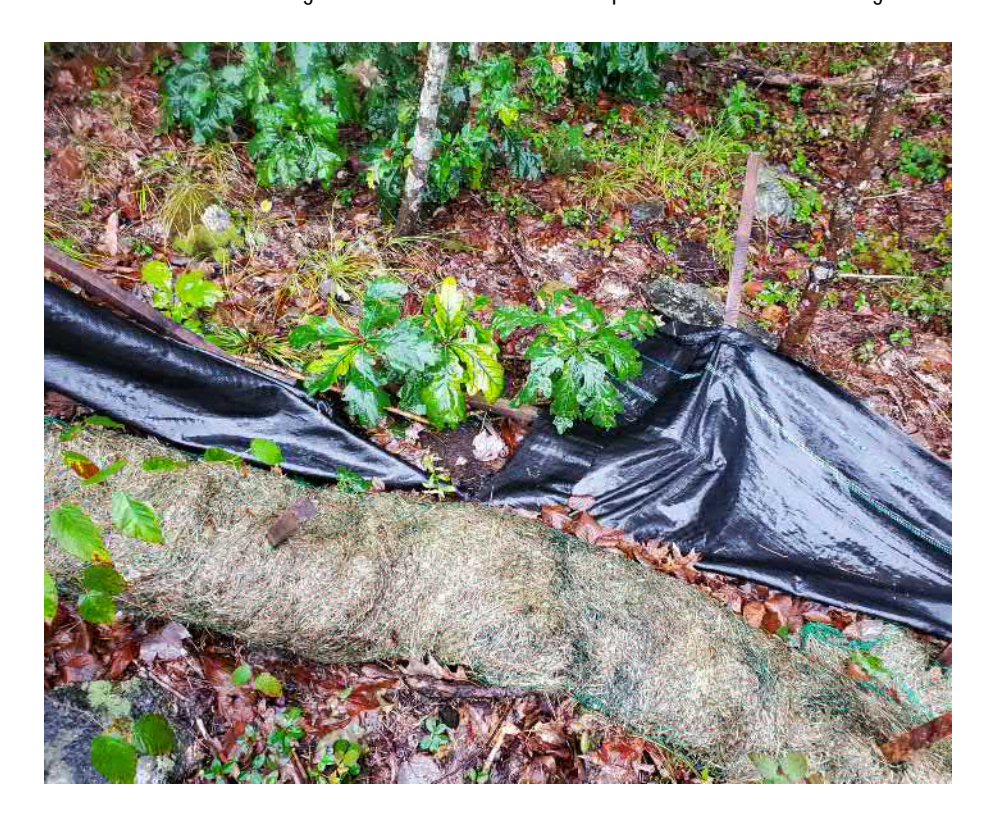
View of damaged silt fence in southeastern portion of the Site — facing northeast

PHOTOGRAPHIC DOCUMENTATION North Sturbridge Road Solar Facility Charlton, Massachusetts Photographs Documented 9.6.2022