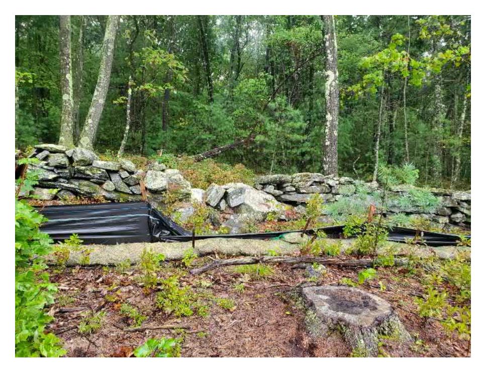
View of damaged silt fence in northeastern portion of the Site — facing east