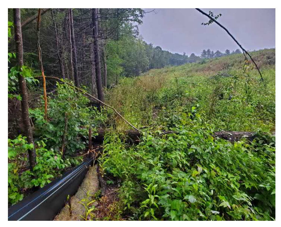
View of fallen tree damage to silt fence in southwestern portion of the Site — facing north